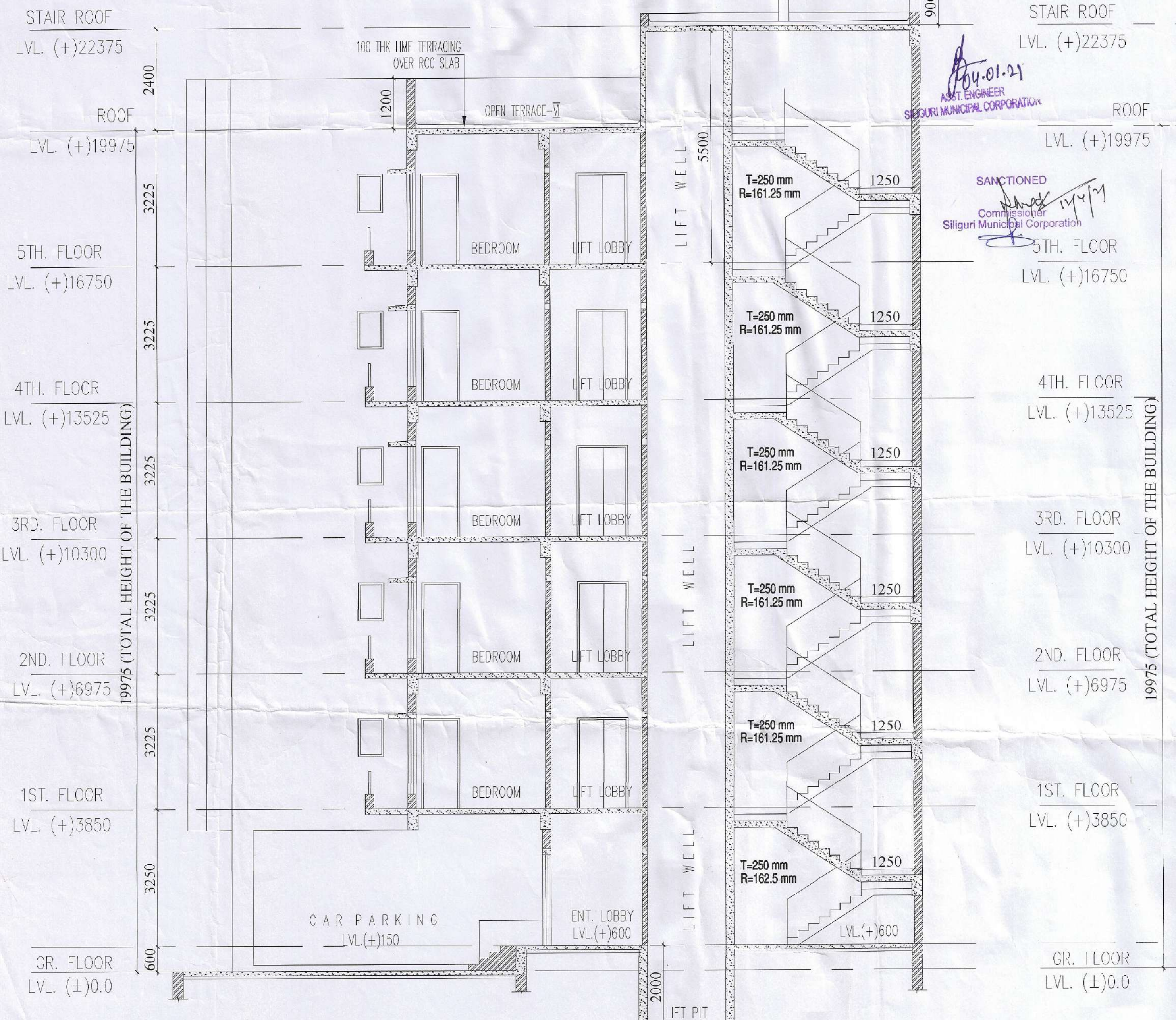
SECTION AT 6A-6A WING-6

THIS PLAN IS CONDITIONALLY SANCTIONED THAT NO OBJECTION CERTIFICATE FROM FIRE SERVICE IS REQUIRED BEFORE OBJECTION OCCUPANCY CERTIFICATE