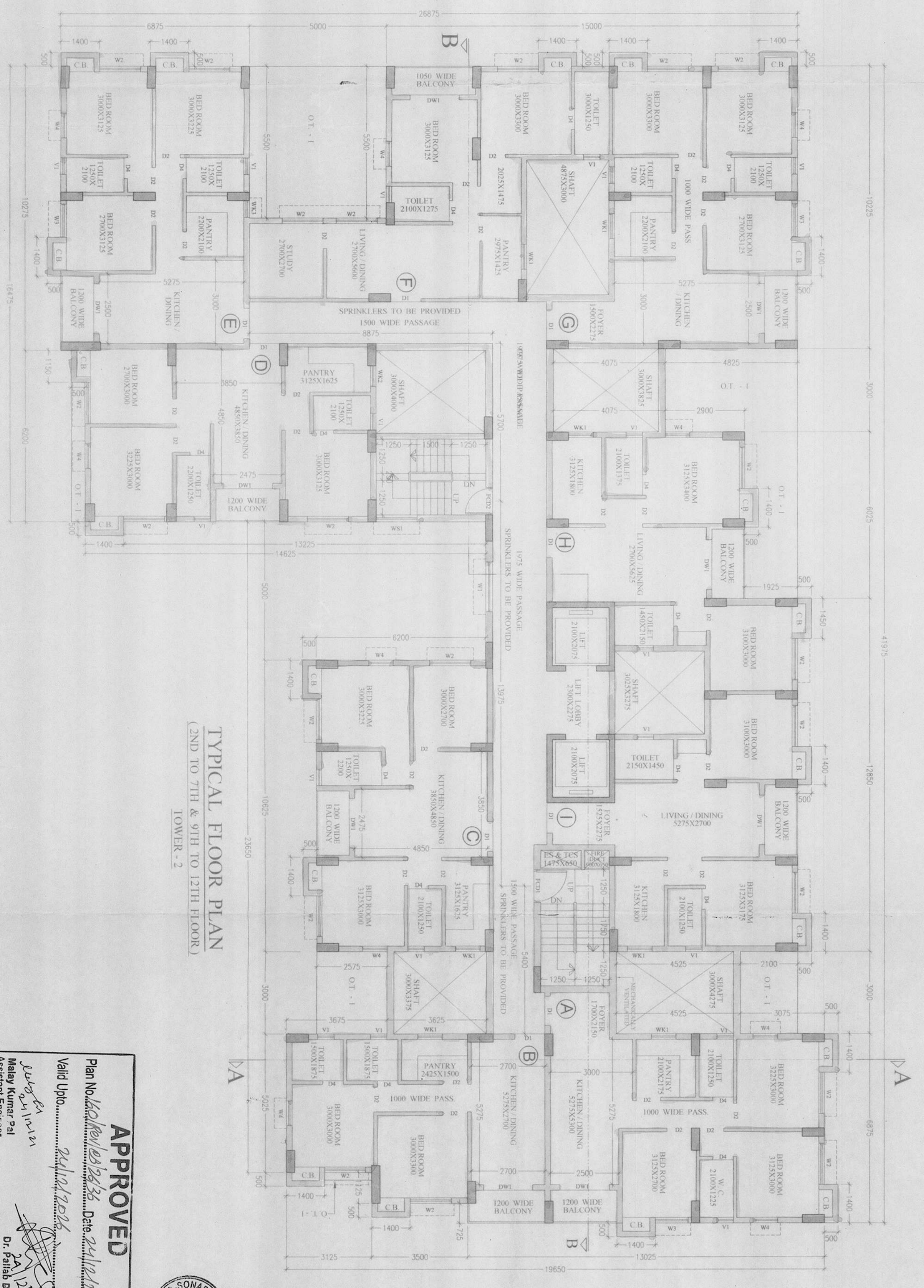
TYPICAL FLOOR PLAN (AND TO 7TH & 9TH TO 12TH FLOOR) TOWER-2