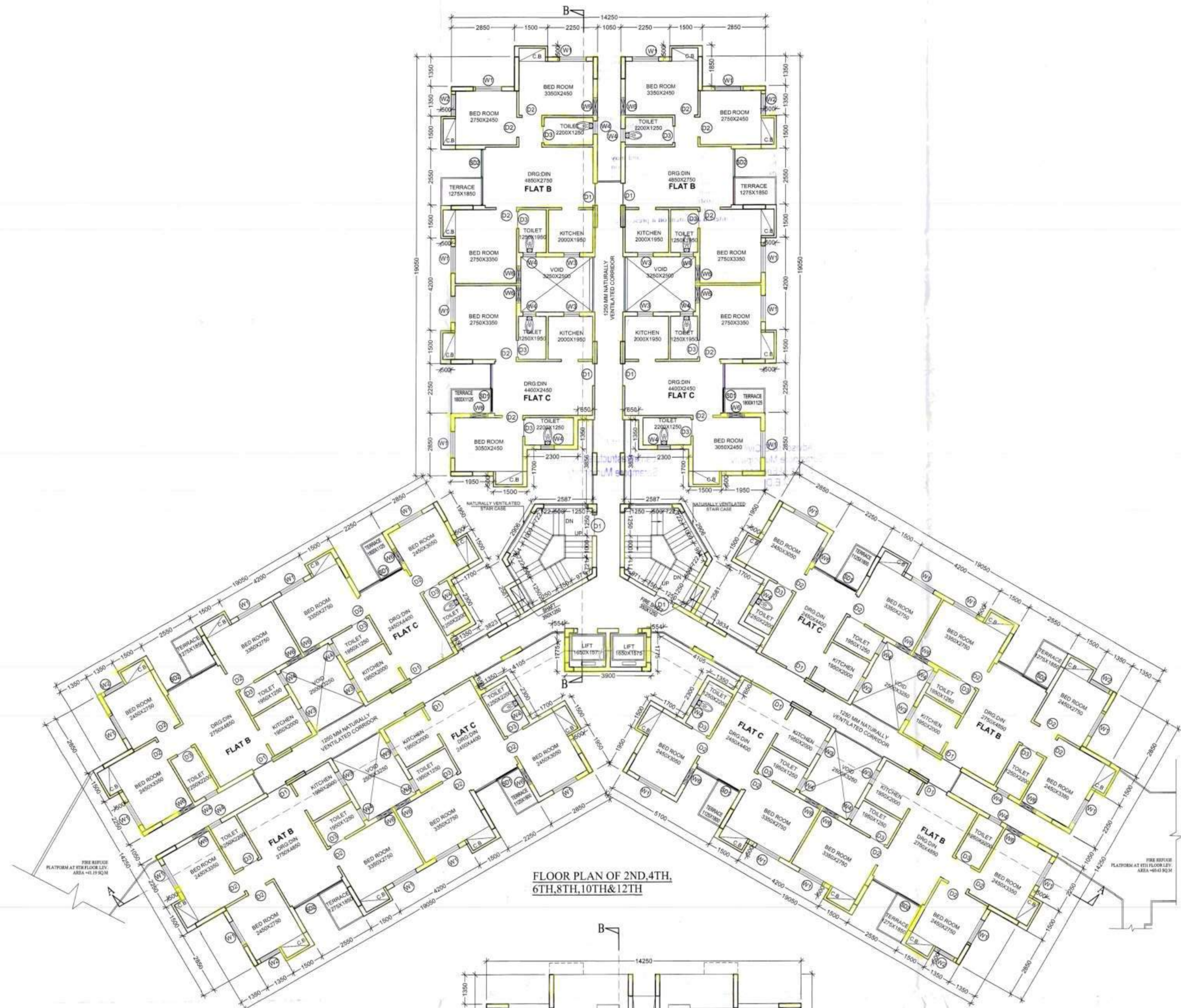
FLOOR PLAN OF 2ND,4TH, 6TH,8TH,10TH&12TH