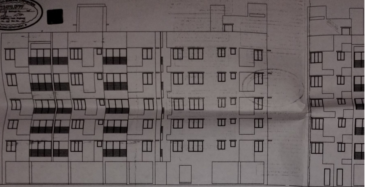
WEST SIDE ELEVATION