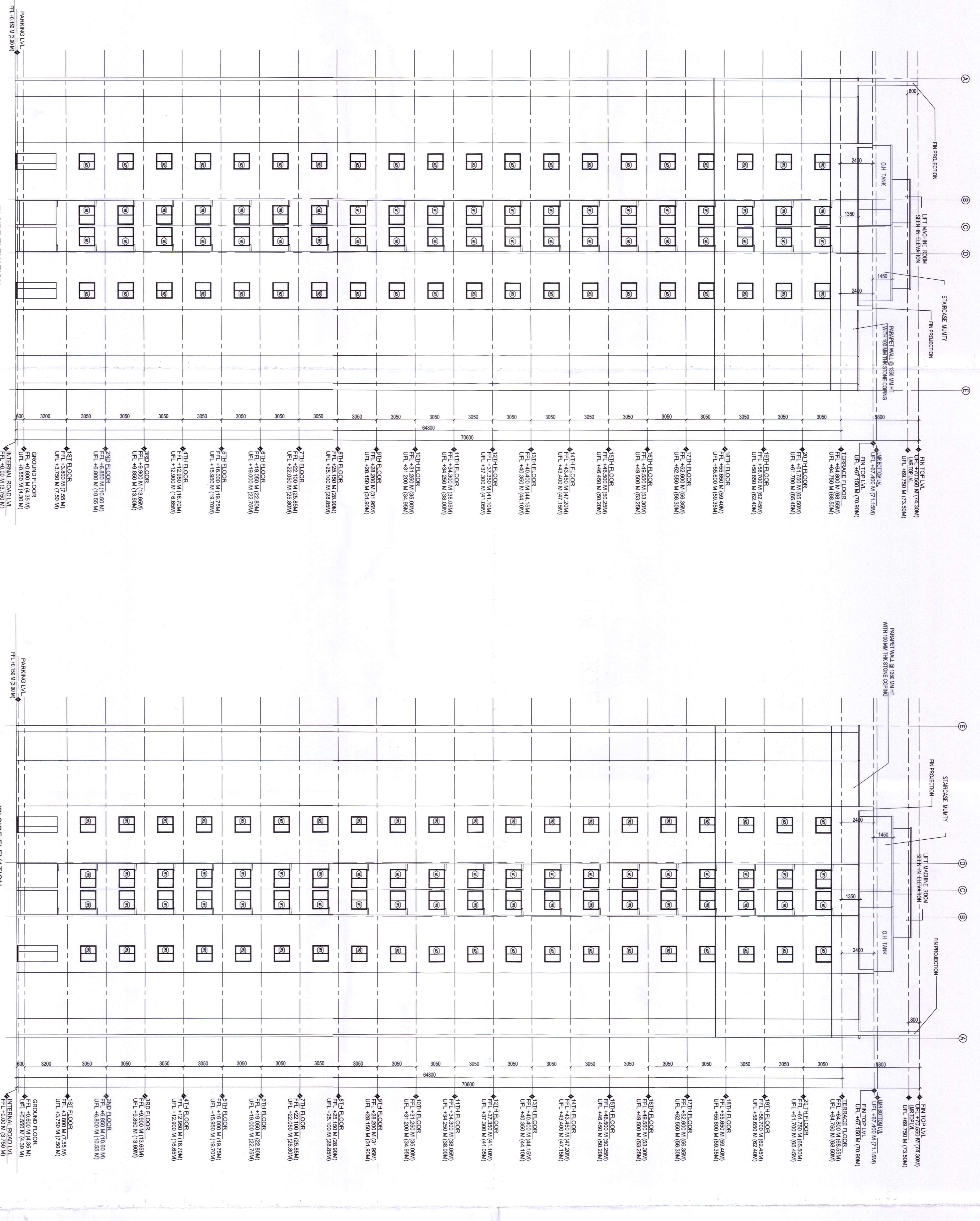
'B' SIDE ELEVATION SCALE 1:125

Plan is Presently approved subject to the changes as marked and on completion of recommendation issued. Director-in-Charge Fire prevention wing Govt. of West Bengal MBB Fire prevention wing Govt. of West Bengal CHECKED BY T. E. C.