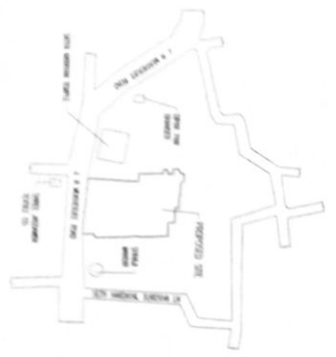
LOCATION PLAN SCALE 1:4000

[North Arrow] ARCHITECT SRI / MALAVI & ASSOCIATES 88, WOOD STREET, KOLKATA-16