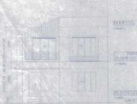
ELEVATION OF SIDE A