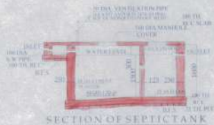
SECTION OF SEPTIC TANK