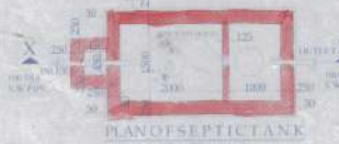
PLAN OF SEPTIC TANK (for 30 users)