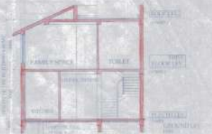
SECTION AT XX