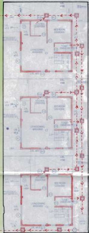
OVERALL SITE PLAN SHOWING GROUND FLOOR PLAN WITH SEWERAGE LAYOUT