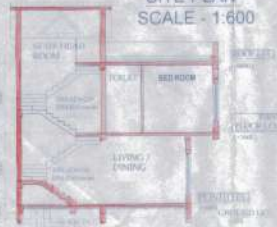
SECTION AT YY