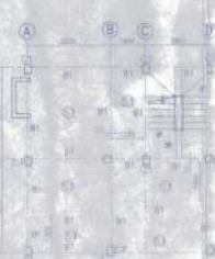
FLOOR BEAM LAYOUT PLAN SCALE: 1:100