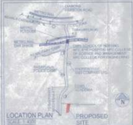
LOCATION PLAN SCALE: 1:500

I CERTIFY THAT ALL THE ARCHITECTURAL DRAWINGS OF PROPOSED TWO STORED BUILDING AT R.S. DAG NO. 67(P), 68(P), MOLEZA-UTTAR HAZIRAT, I.L. NO. 22 UNDER P.S. BISHNUPUR, P.O. RASAPUNJA, DIST. SOUTH 24 PARGANAS, UNDER PASCHIM BISHNUPUR GRAM PANCHAYAT HAVE BEEN PREPARED BY ME COMPLYING WITH THE PROVISIONS OF THE NATIONAL BUILDING CODE 2016 AND THE WEST BENGAL MUNICIPAL BUILDING RULES 2017. NO SUCH WORKING AND INCORRECT INFORMATION HAS BEEN FURNISHED BY ME. NO LEGGING AREA CALCULATION CHARTS IN THIS DRAWINGS AND NO VIOLATION OF THE PROVISIONS OF THESE RULES WILL BE FOUND IN ANY OF THE DRAWINGS AND DOCUMENTS. SUBMITTED TO THE SANCTIONING AUTHORITY FOR OBTAINING SANCTIONS.