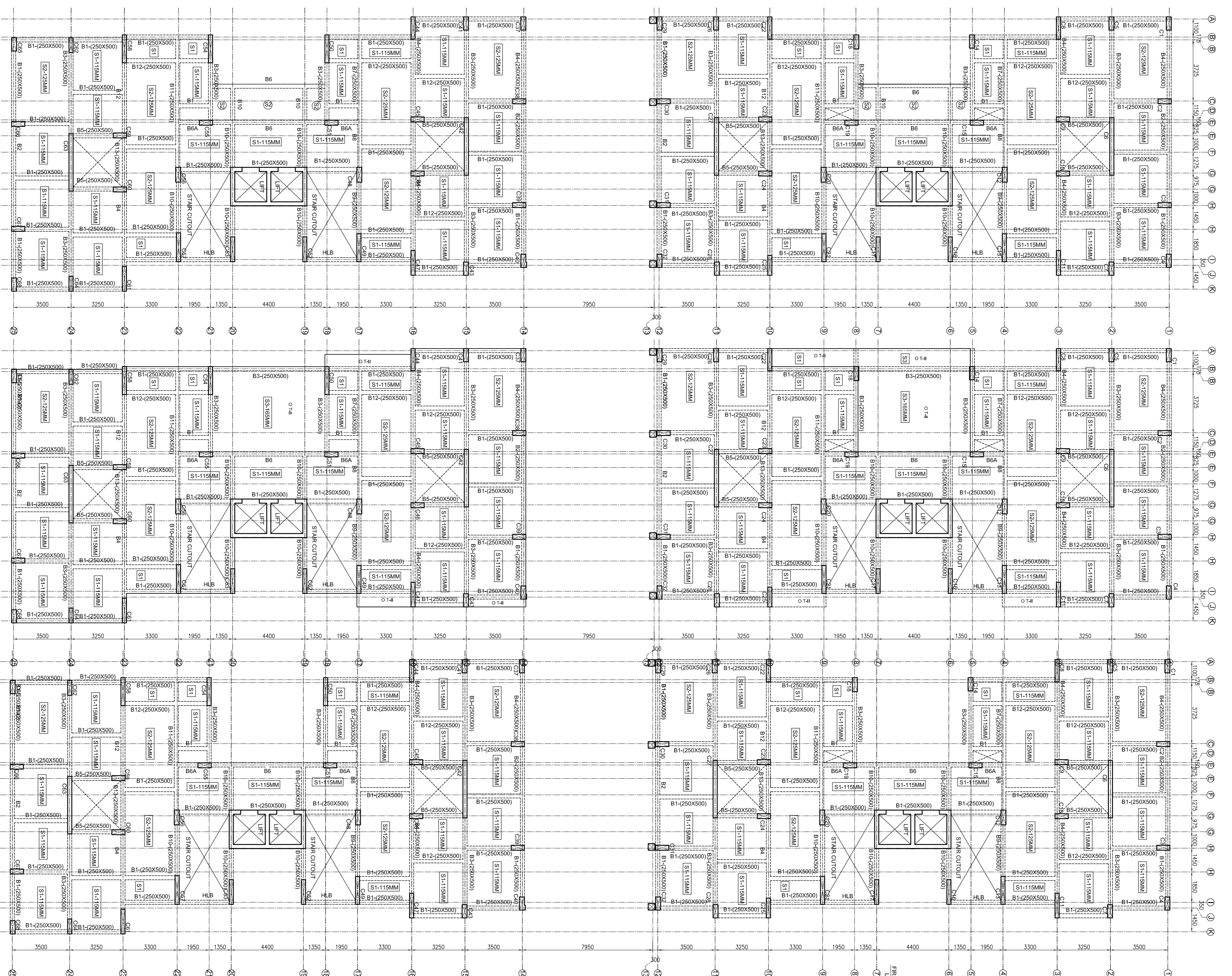
7TH & 10TH FLOOR BEAM LAYOUT PLAN SCALE: 1:100