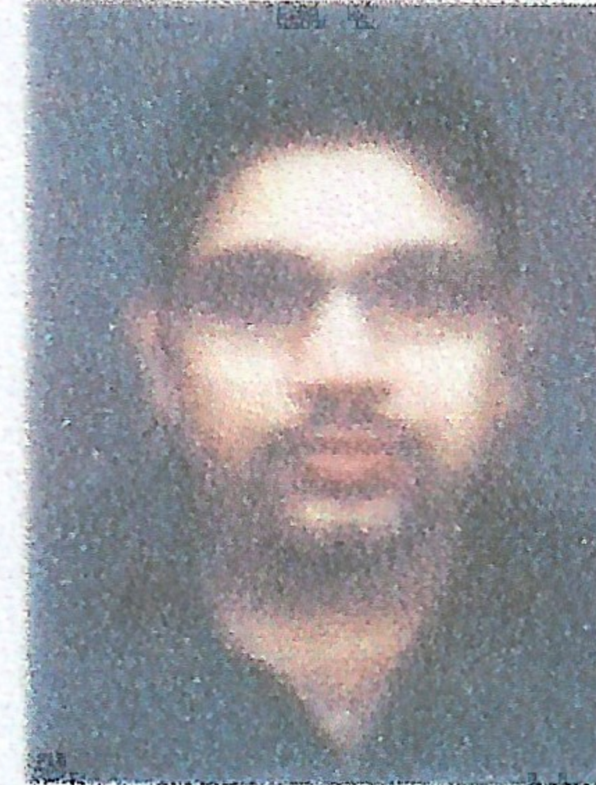
Licence holder sign