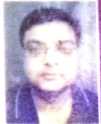
Licence holder sign