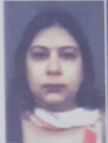
Licence holder sign

FLAT NO-19-D BLOCK-5 54/10 D C DEY ROAD KOLKATA 700015