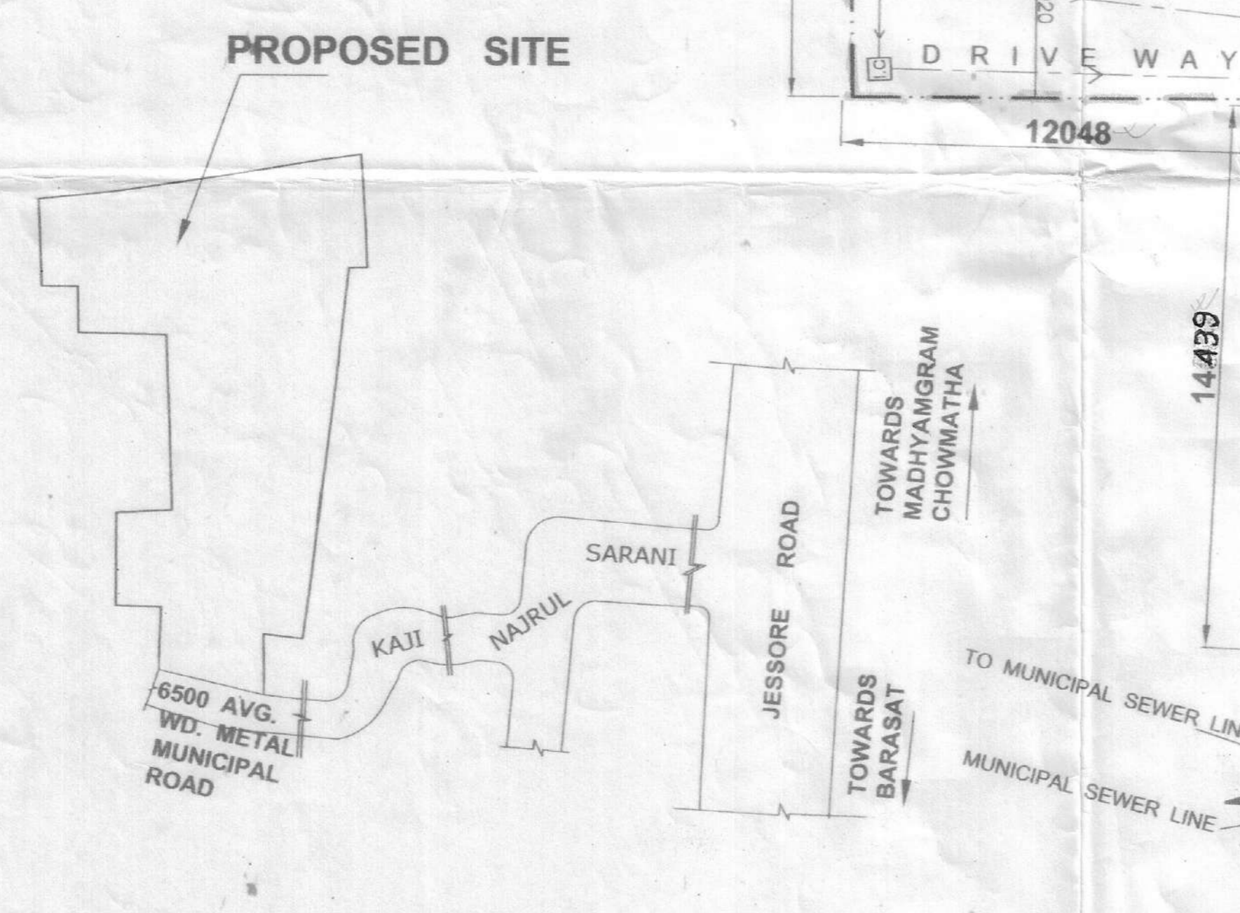
LOCATION PLAN NOT TO SCALE