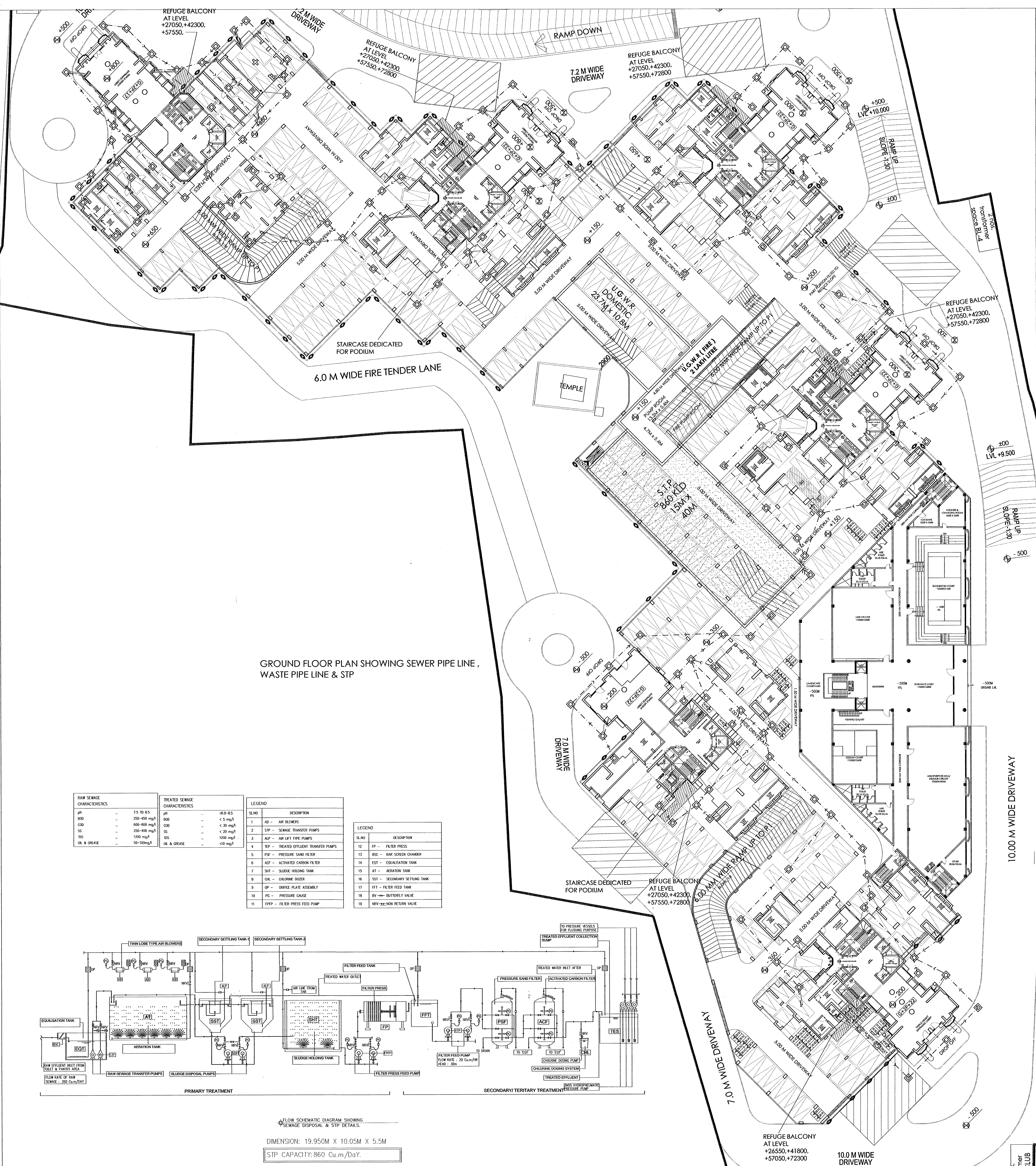
GROUND FLOOR PLAN SHOWING SEWER PIPE LINE, WASTE PIPE LINE & STP