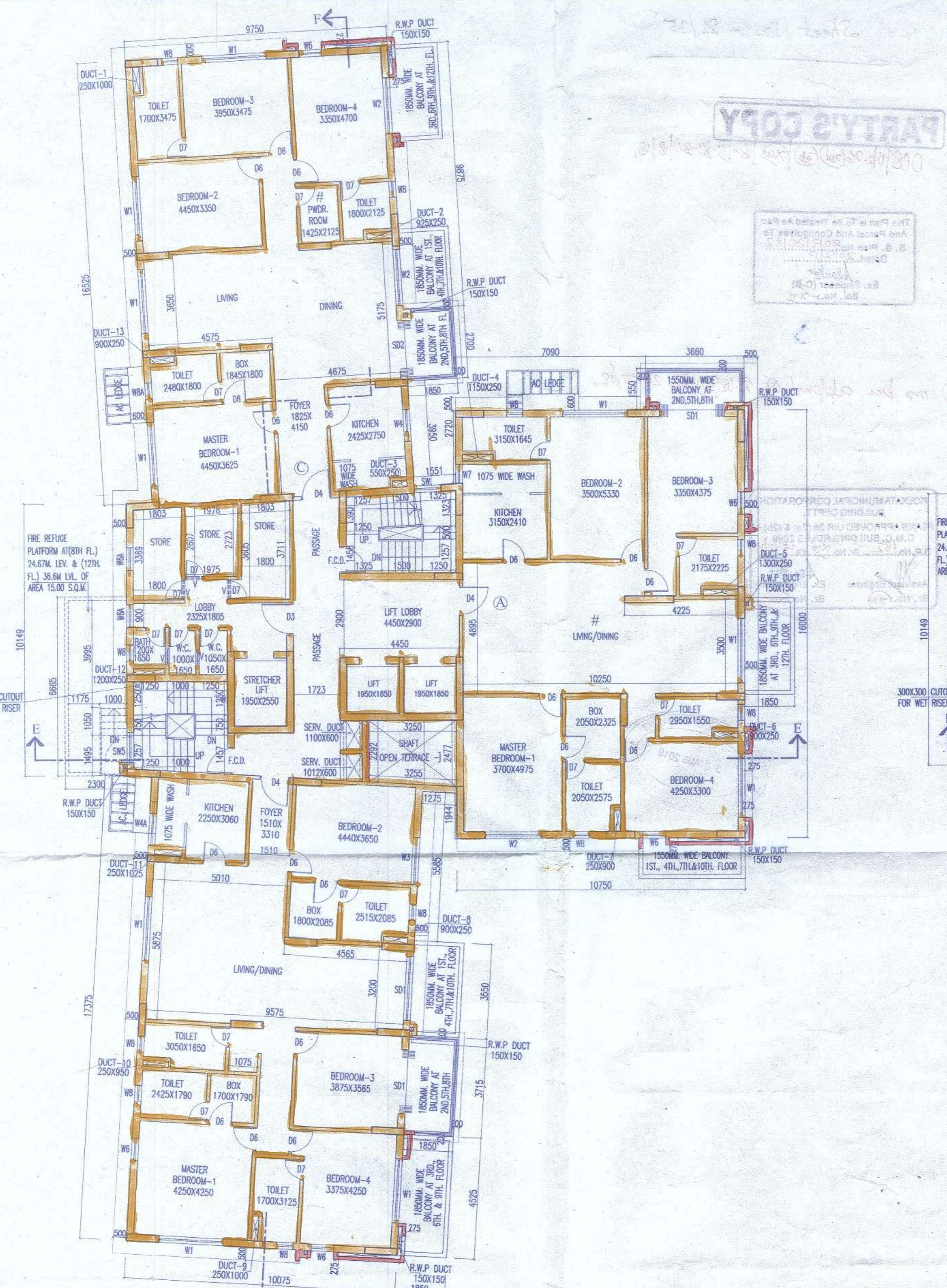
2ND, 5TH, 8TH FLOOR PLAN