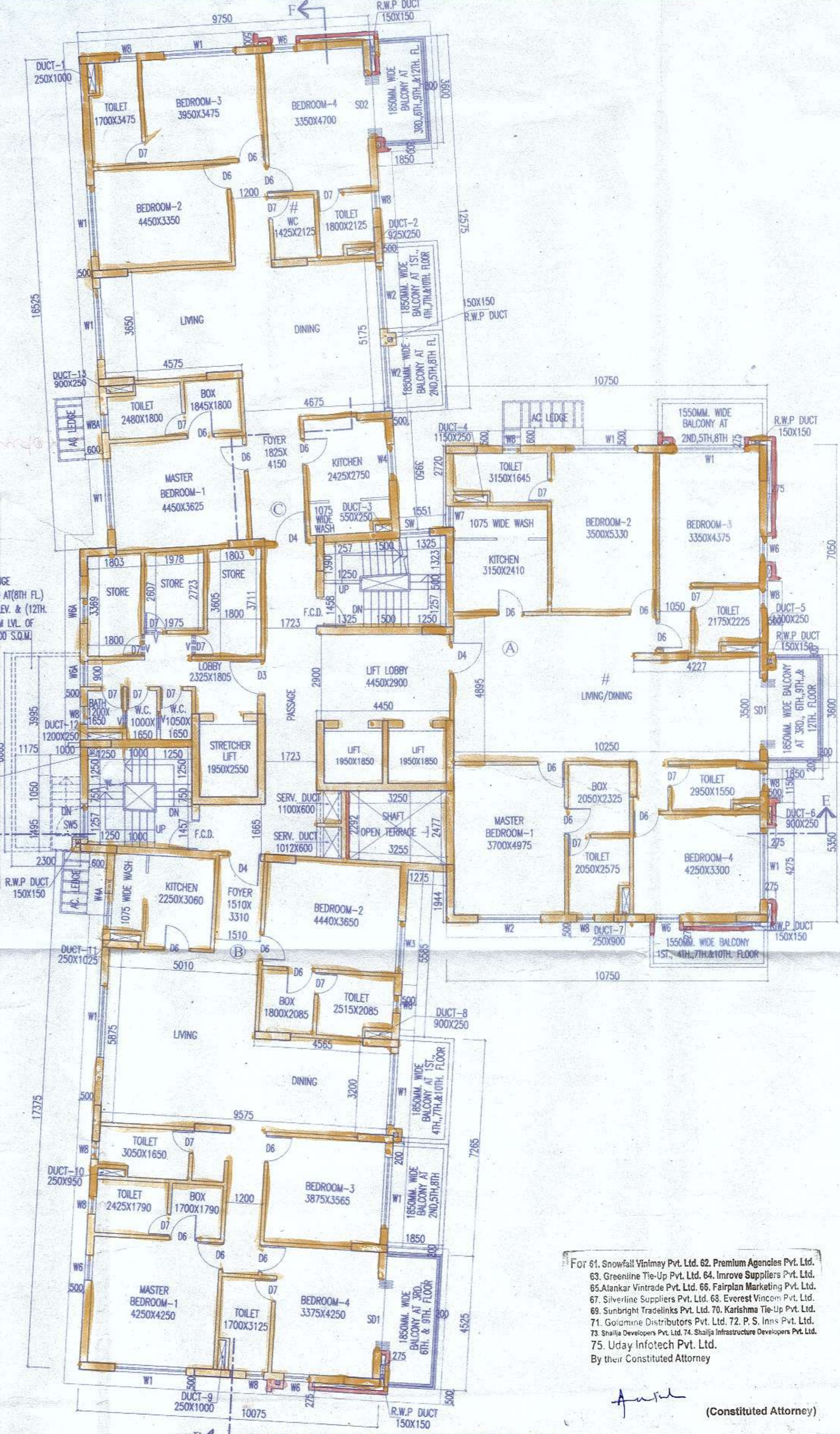
3RD, 6TH & 9TH FLOOR PLAN