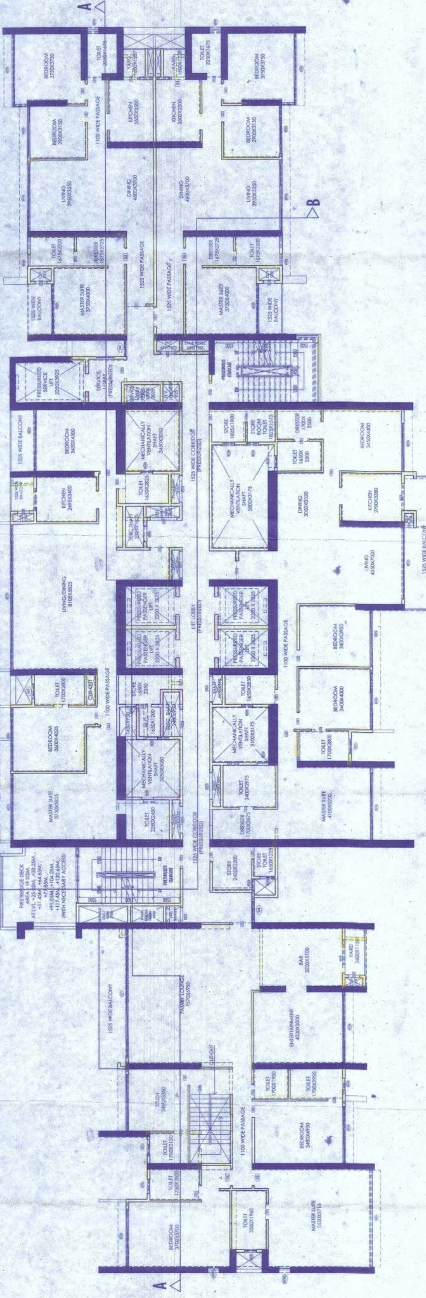
21ST ( DUPLEX UPPER FLOOR ) FLOOR PLAN OF BLOCK-A