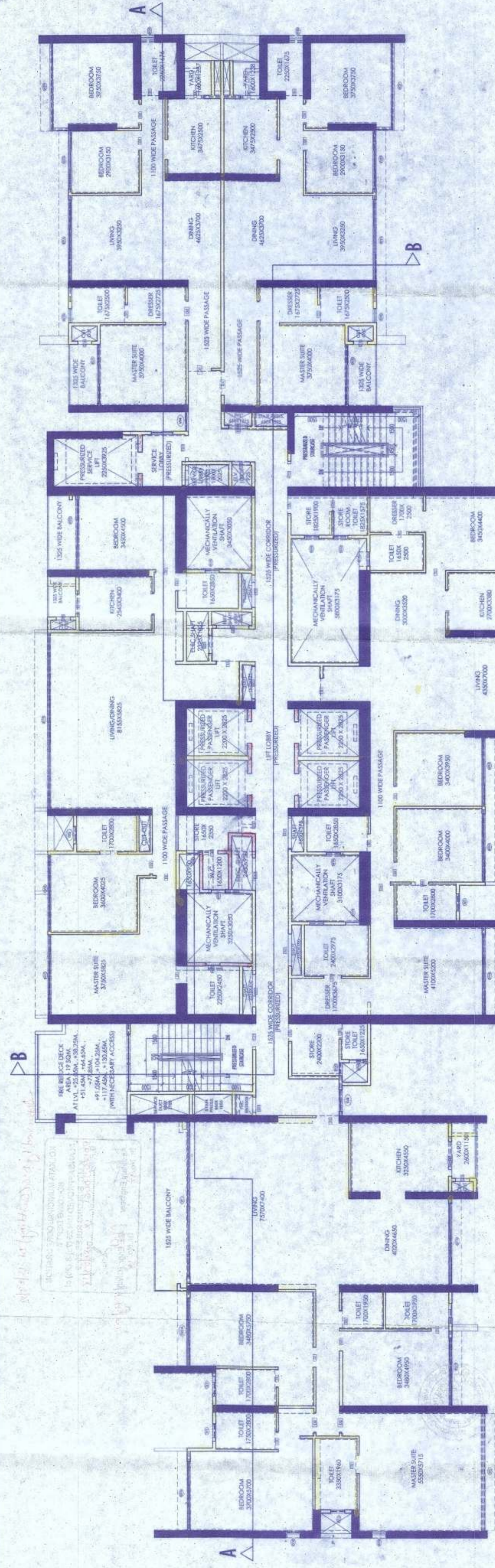
TYPICAL (22ND TO 25TH) FLOOR PLAN OF BLOCK-A

ARCHITECT Subir Kumar Basu 200919 (T) +91 33 23870333 (F) +91 33 23833043 (E) basu_subir@rediffmail.com DISCIPLINE ARCHITECTURAL DRAWING TITLE 20TH TO 25TH FLOOR PLAN OF BLOCK - A DRAWN BY MUMUKSHU CHECKED BY S.K. BASU APPROVED BY S.K. BASU DRAWING NO. -SKB/DIR/RC/26/12 SHEET NO. 12 OF 16 SHEET SIZE & SCALE. A0 & 1:100 DATE 23.11.2020