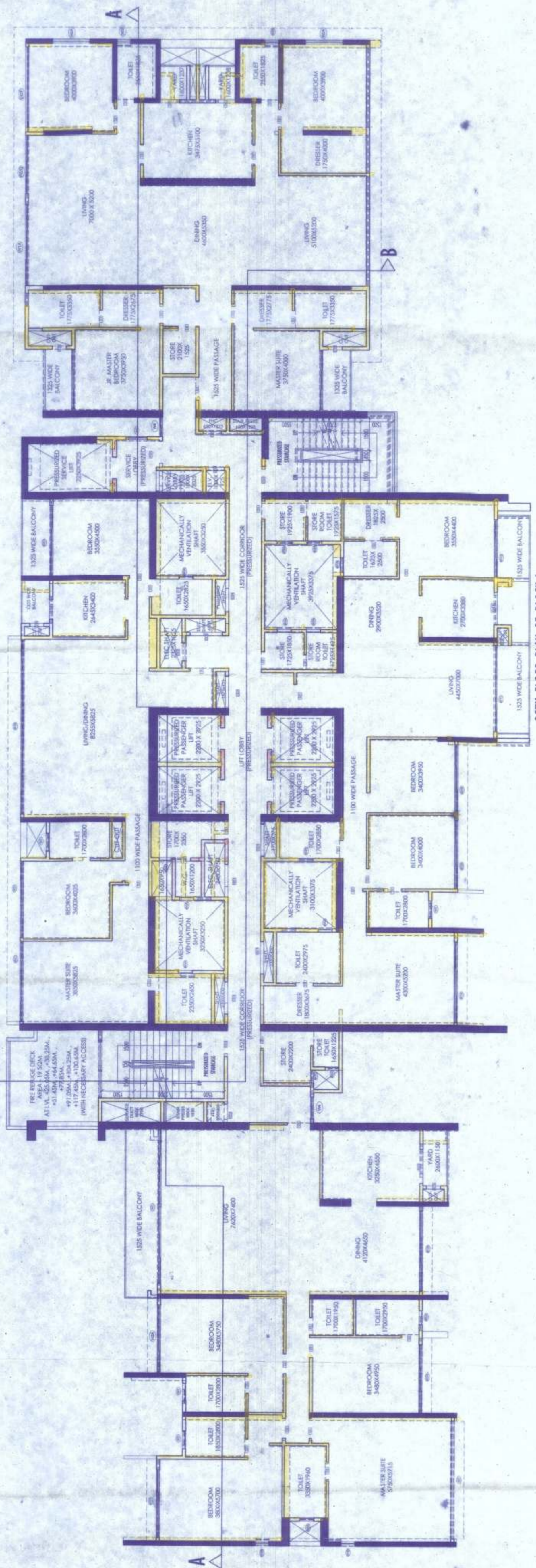
38TH FLOOR PLAN OF BLOCK-A