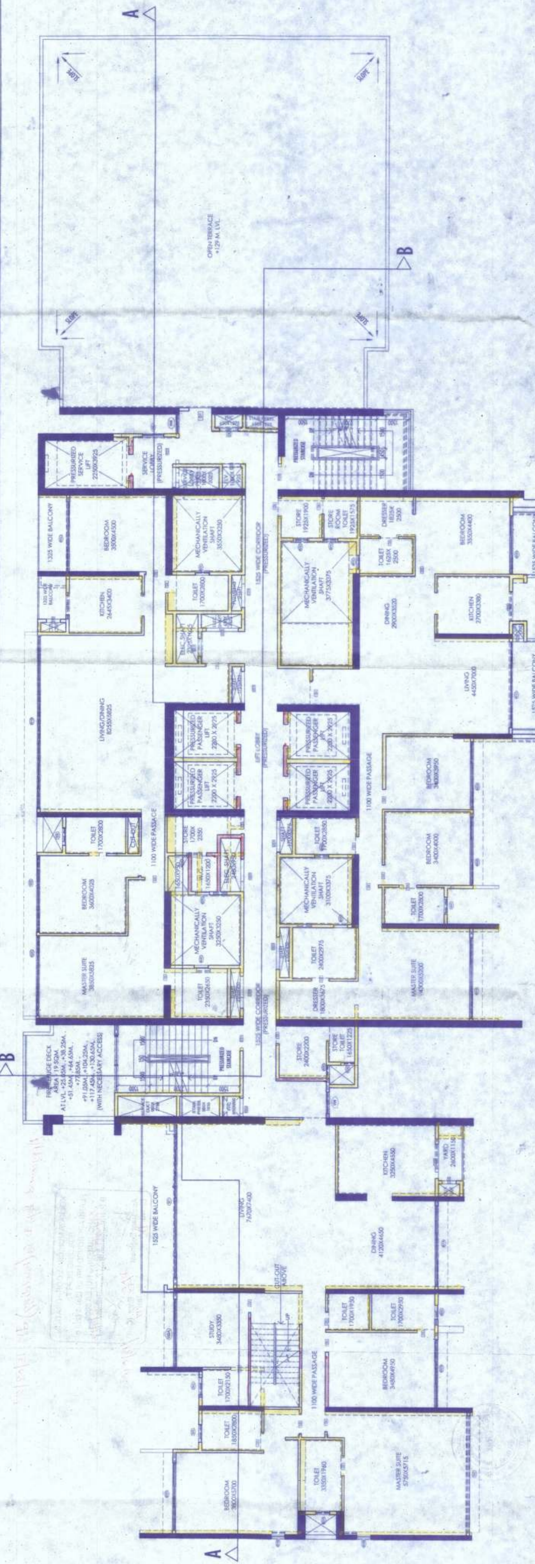
37TH (DUPEX LOWER FLOOR) FLOOR PLAN OF BLOCK-A

DRAWING TITLE 37TH TO 38TH FLOOR PLAN OF BLOCK - A DRAWN BY MAMUKERJEE CHECKED BY S.K. BANERJEE APPROVED BY S.K. BANERJEE DRAWING NO. : SKB/DB/ARC/RB/20/14 SHEET NO. : 14 OF 16 SHEET SIZE & SCALE : A0 & 1:100 DATE : 23.11.2020