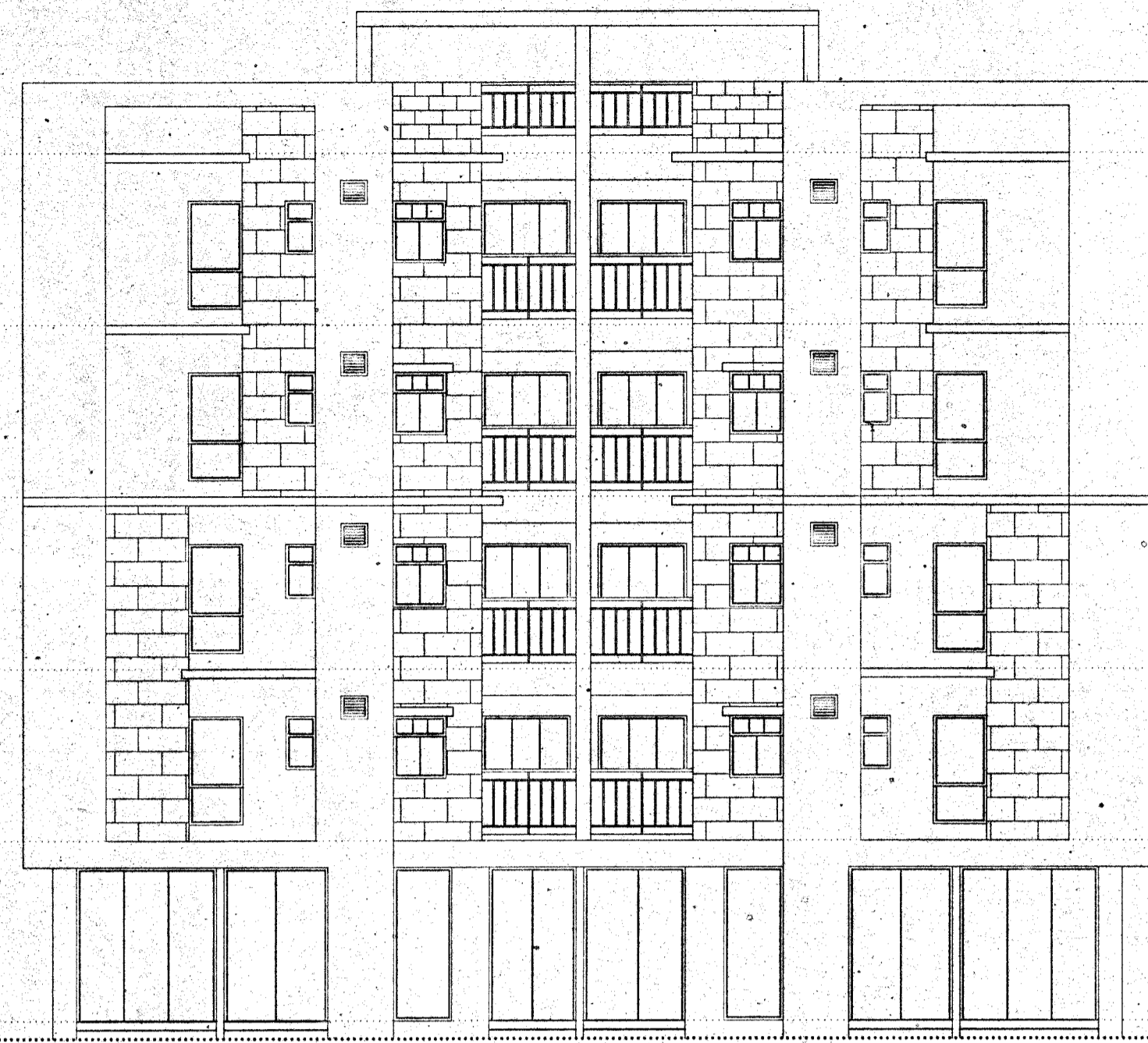
FRONT SIDE ELEVATION