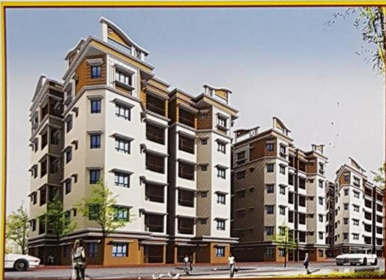
Ganges Garden (Shibpur, Howrah)