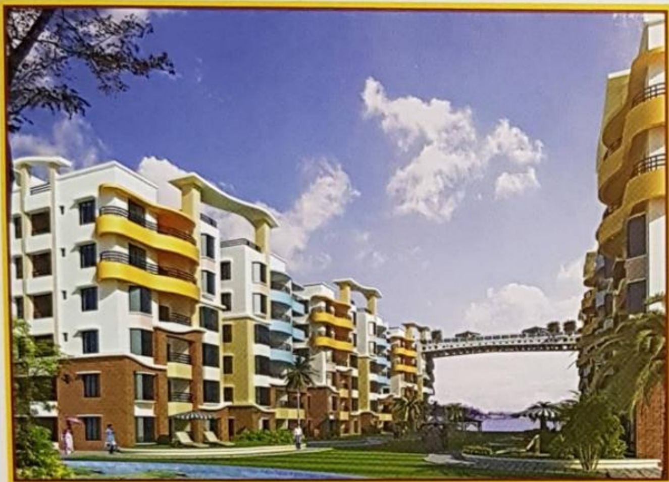
Ganges Puja (Hindmotor, Hooghly)