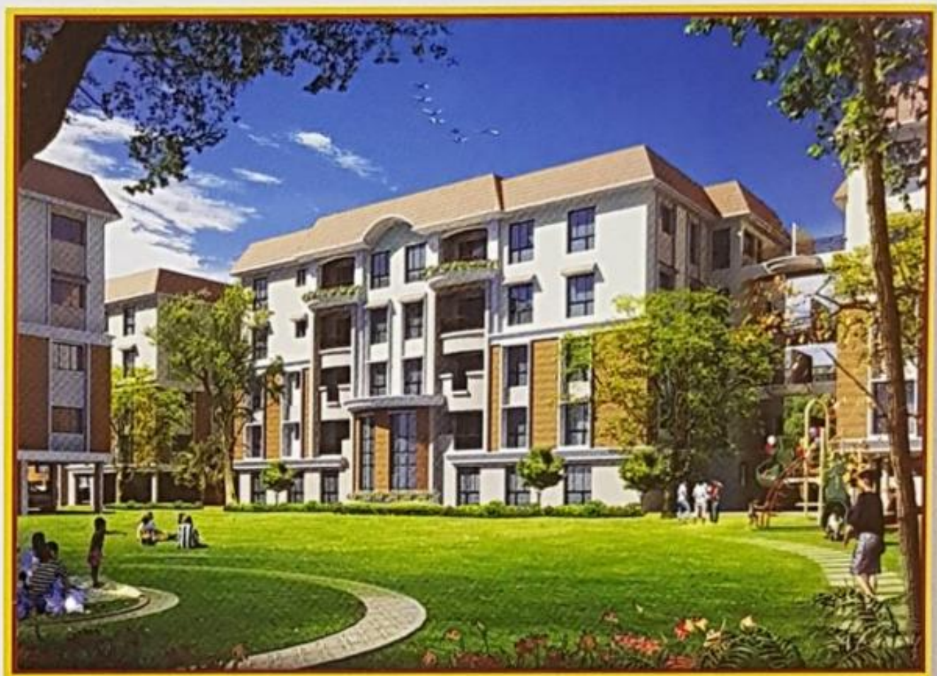
Baalajee Ganges (Ultadanga, Kolkata)