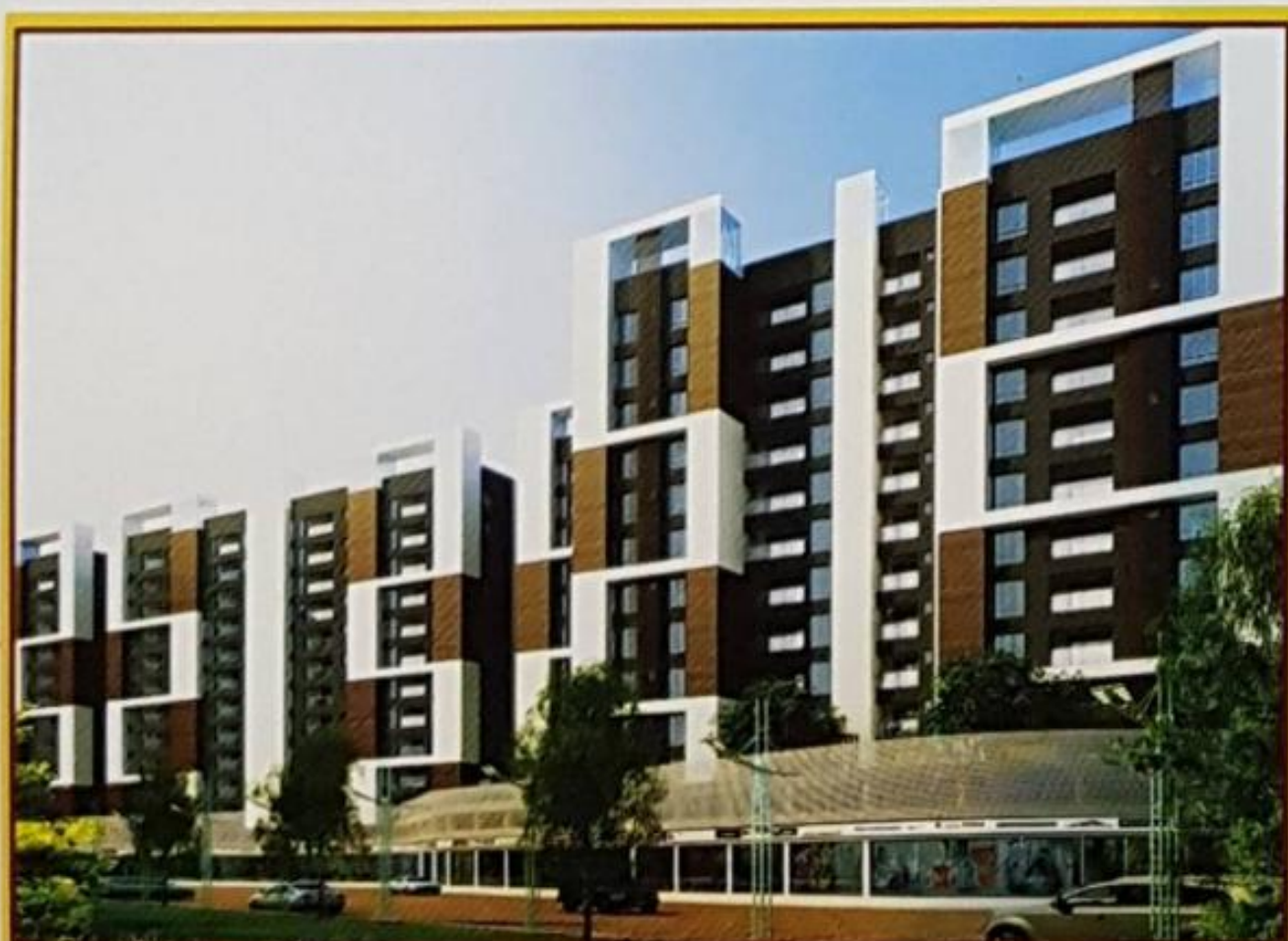
Ganges Skyyyy... (Shibpur, Howrah)