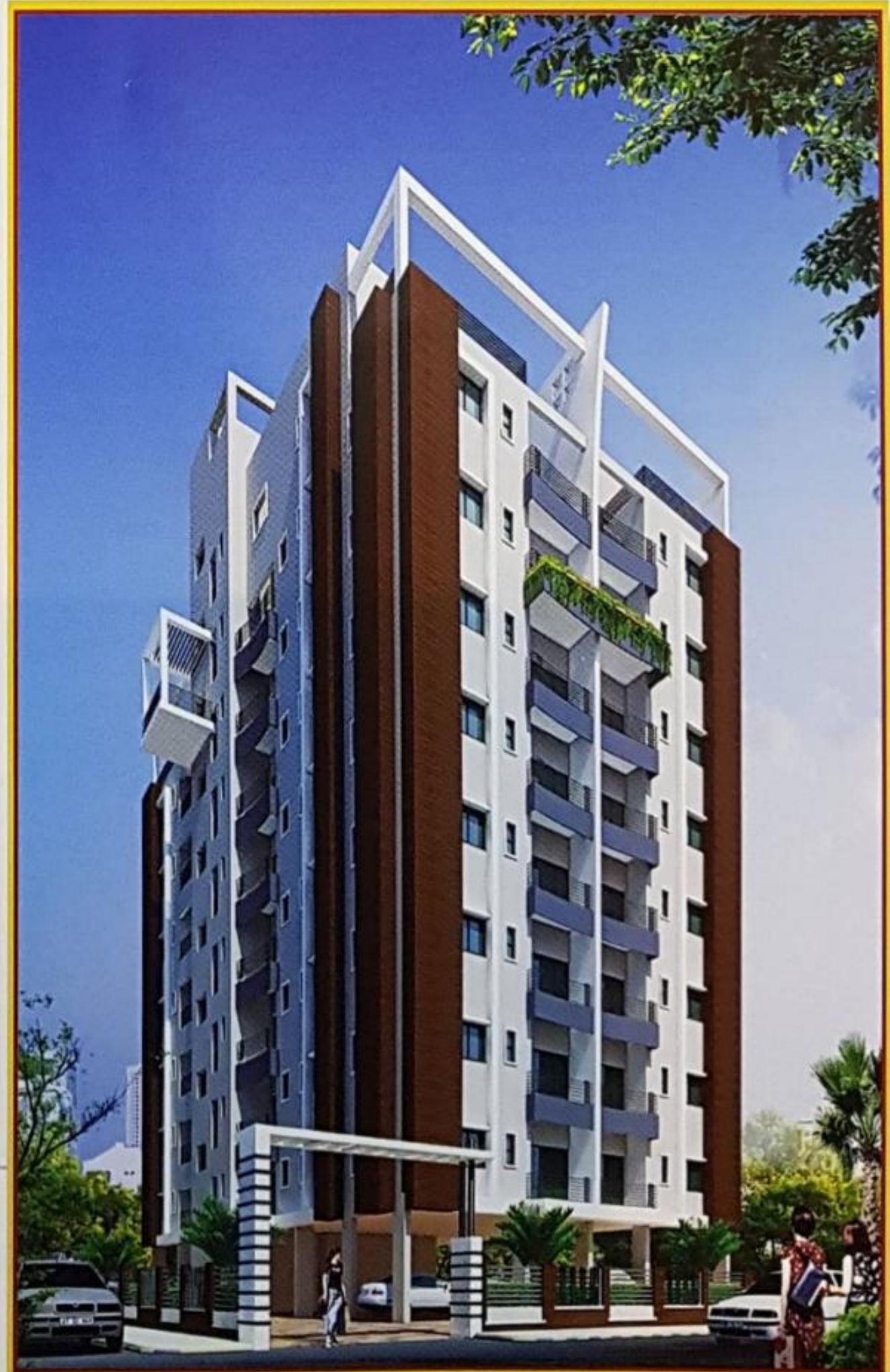
Ganges Castle (New Alipore, Kolkata)