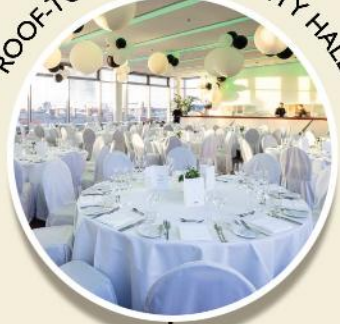
ROOF-TOP AC COMMUNITY HALL