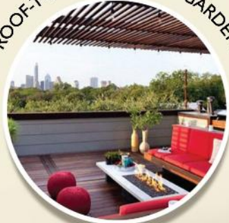
ROOF-TOP DECORATIVE GARDEN