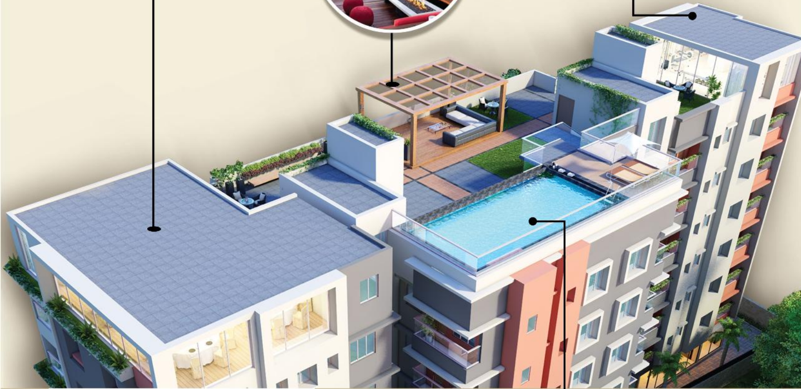
ROOF-TOP SWIMMING POOL WITH DECK