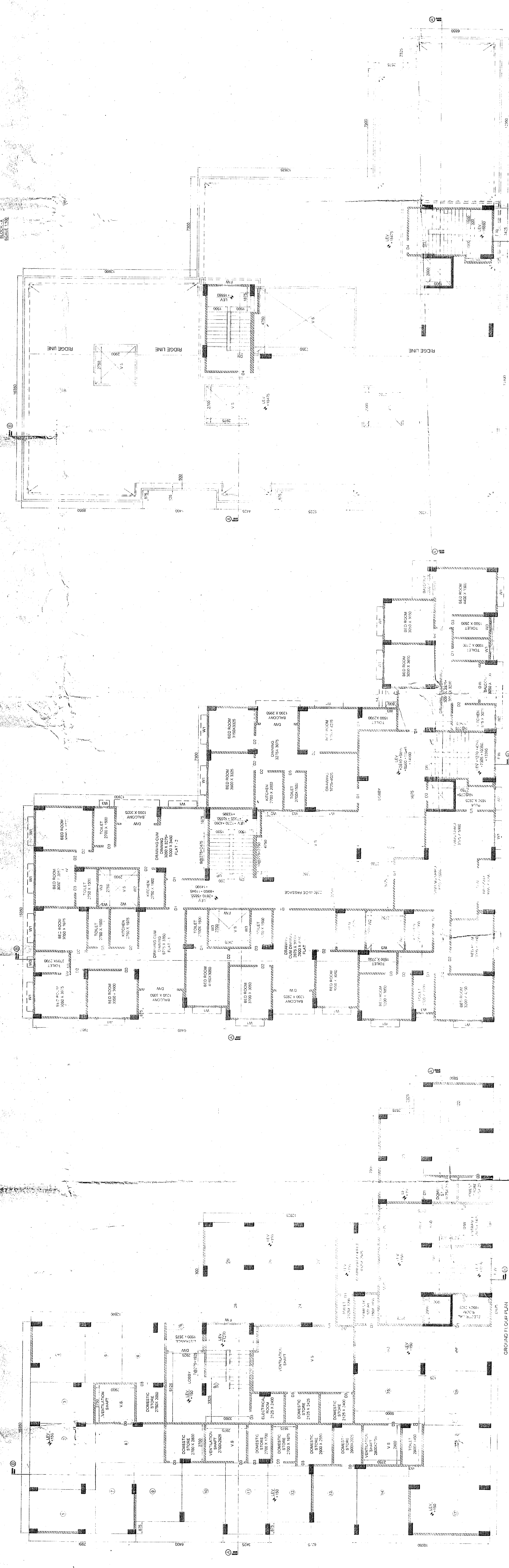
3RD, 4TH & 5TH FLOOR PLAN BLOCK A SCALE: 1/100

CONSULTANTS GREEN HILLS CONSULTANTS CONSULTING ENGINEERS 11F FLOOR NATIONAL COMMERCE HOUSE SILIGURI - 734001