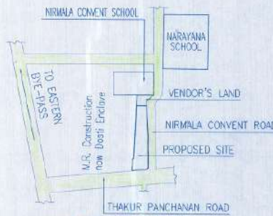
LOCATION PLAN SCALE - 1:4000

THIS PLAN IS CONDITIONALLY SANCTIONED THAT NO OBJECTION CERTIFICATE FROM THE SERVICE IS REQUIRED BEFORE OBTAINING OCCUPANCY CERTIFICATE