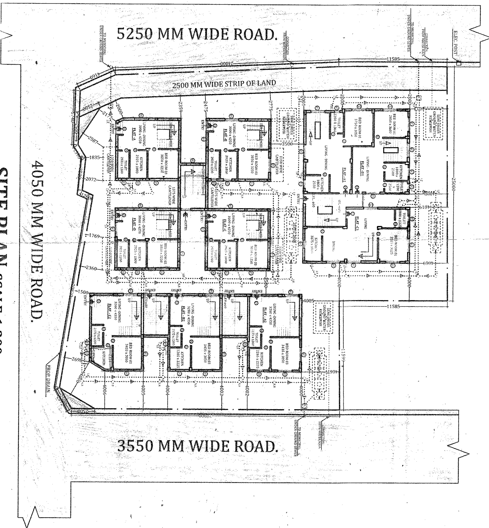
SITE PLAN SCALE-1:200