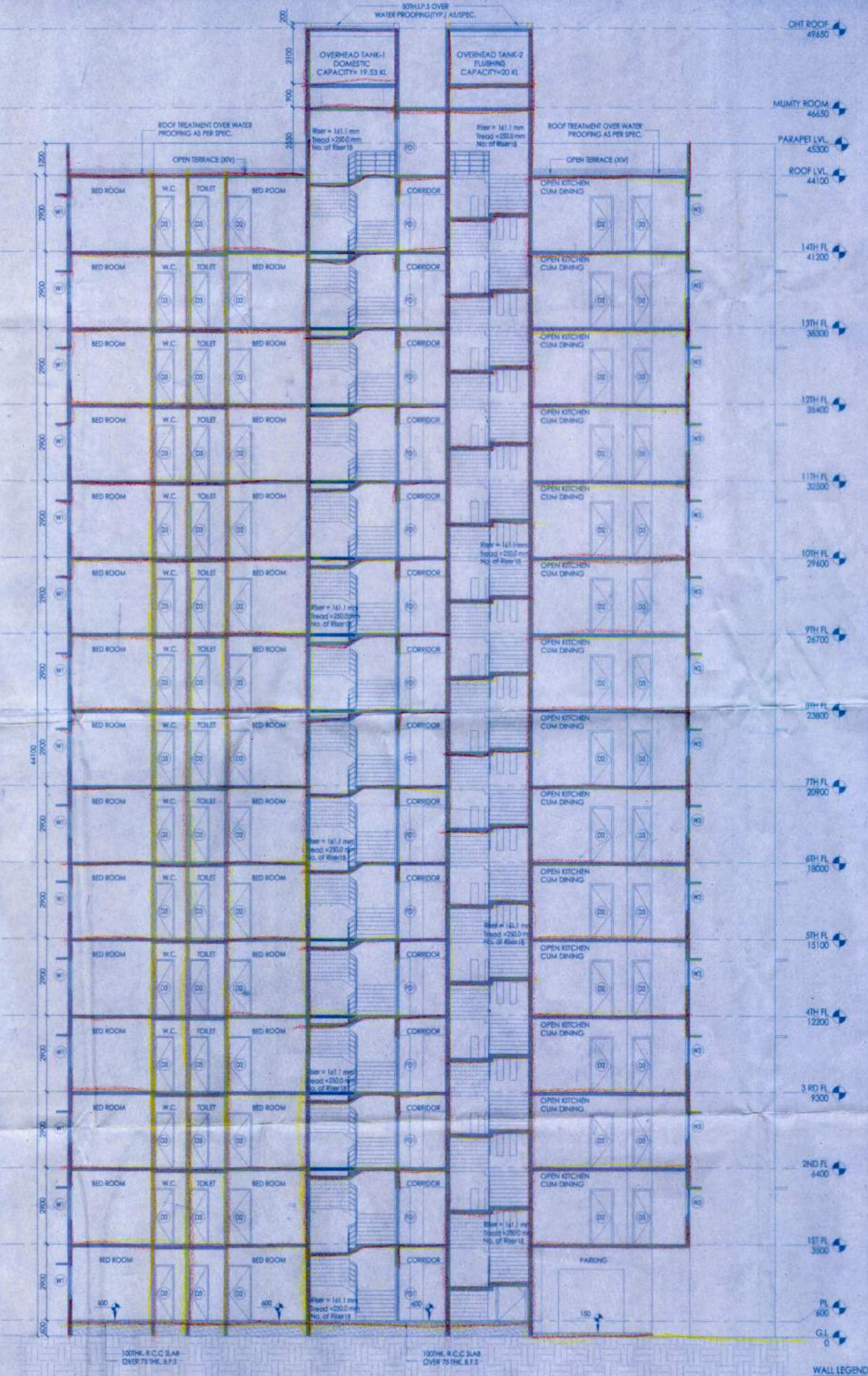
SECTION DD SCALE: 1:100

PROJECT PROPOSED TOWNSHIP "CALCUTTA RIVERSIDE" PROJECT AT BATANAGAR, MOUZA - MIRPUR, BANGLA, JAGTALA AND NANGI WARD NO. 27 & 28 MAHESHTALA MUNICIPALITY, SOUTH 24 PARGANAS FOR RIVERBANK DEVELOPERS PVT. LTD.