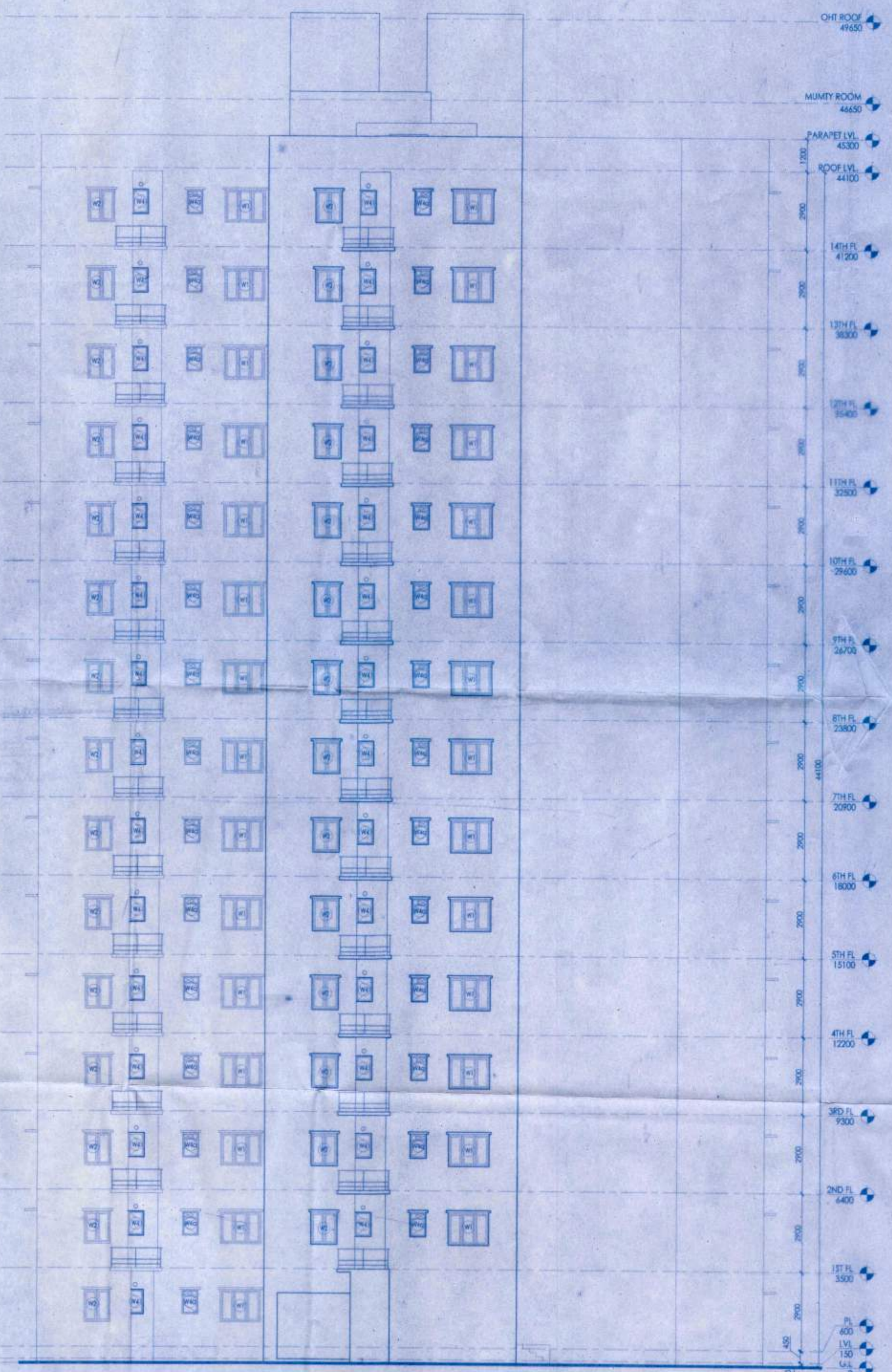
ELEVATION - 4 SCALE-1:100