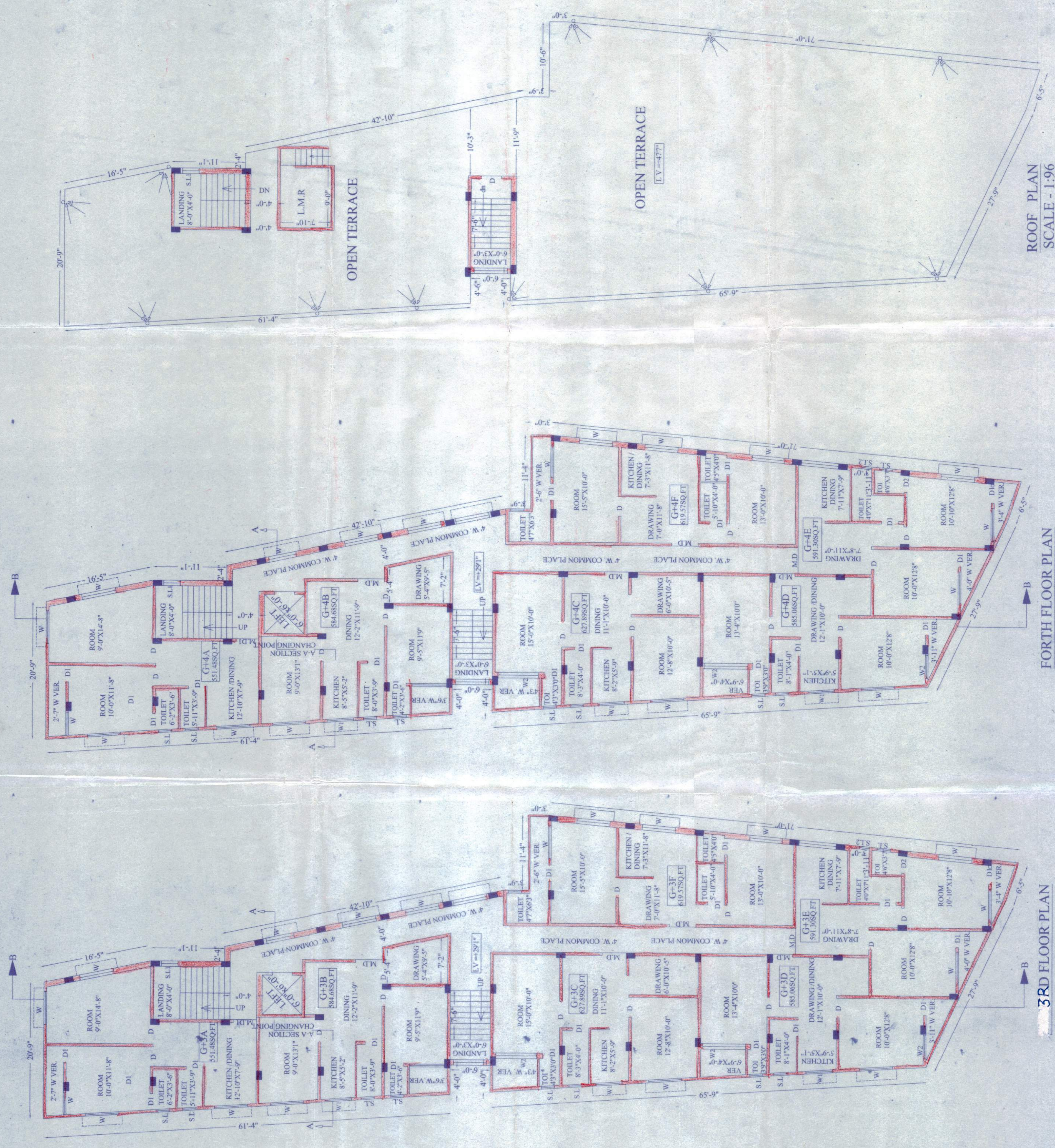
3RD FLOOR PLAN SCALE - 1:96