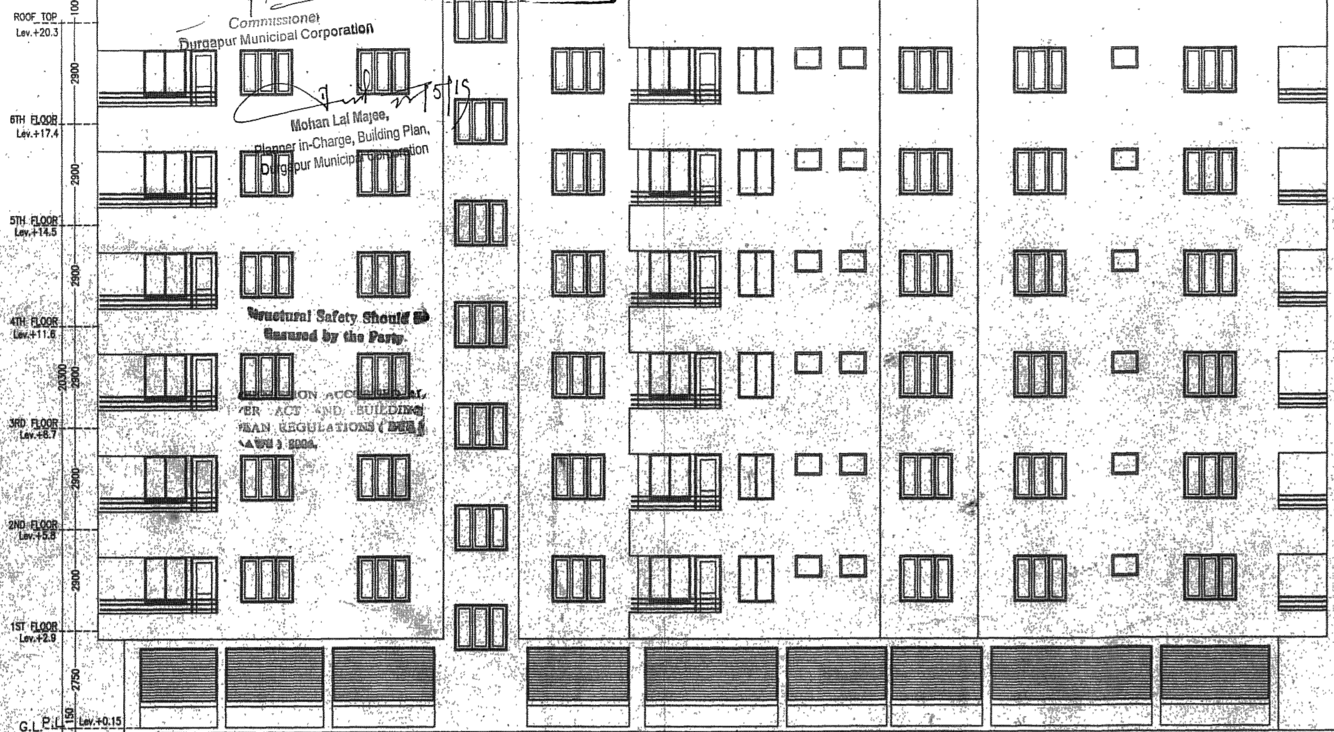
FRONT ELEVATION SCALE-1:100

PLAN No. CB/033/17 RB/CB/18/PB/30W/ APN 20 18 20 18 Date 03.10.2018