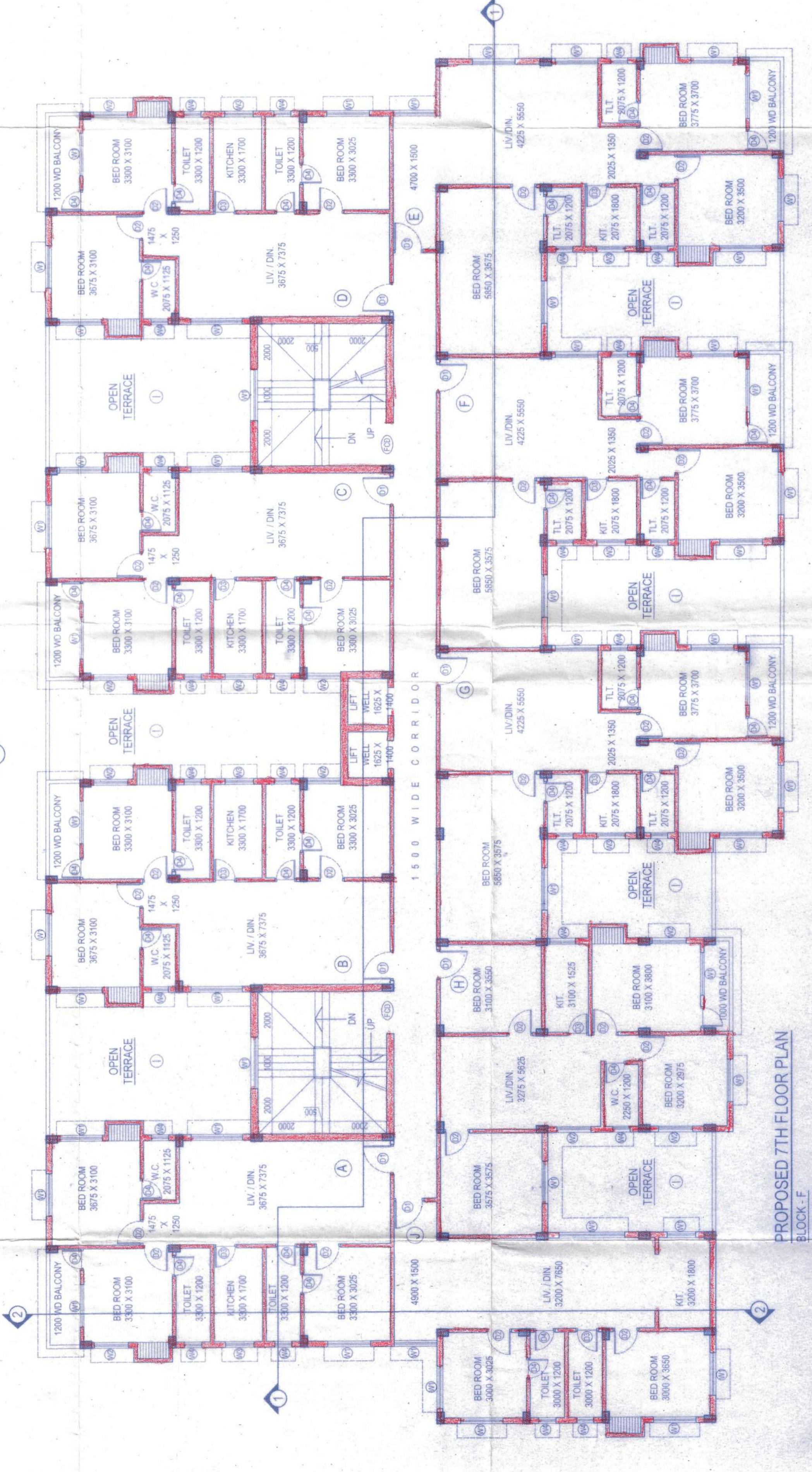
PROPOSED 7TH FLOOR PLAN BLOCK - F SCALE: 1:100