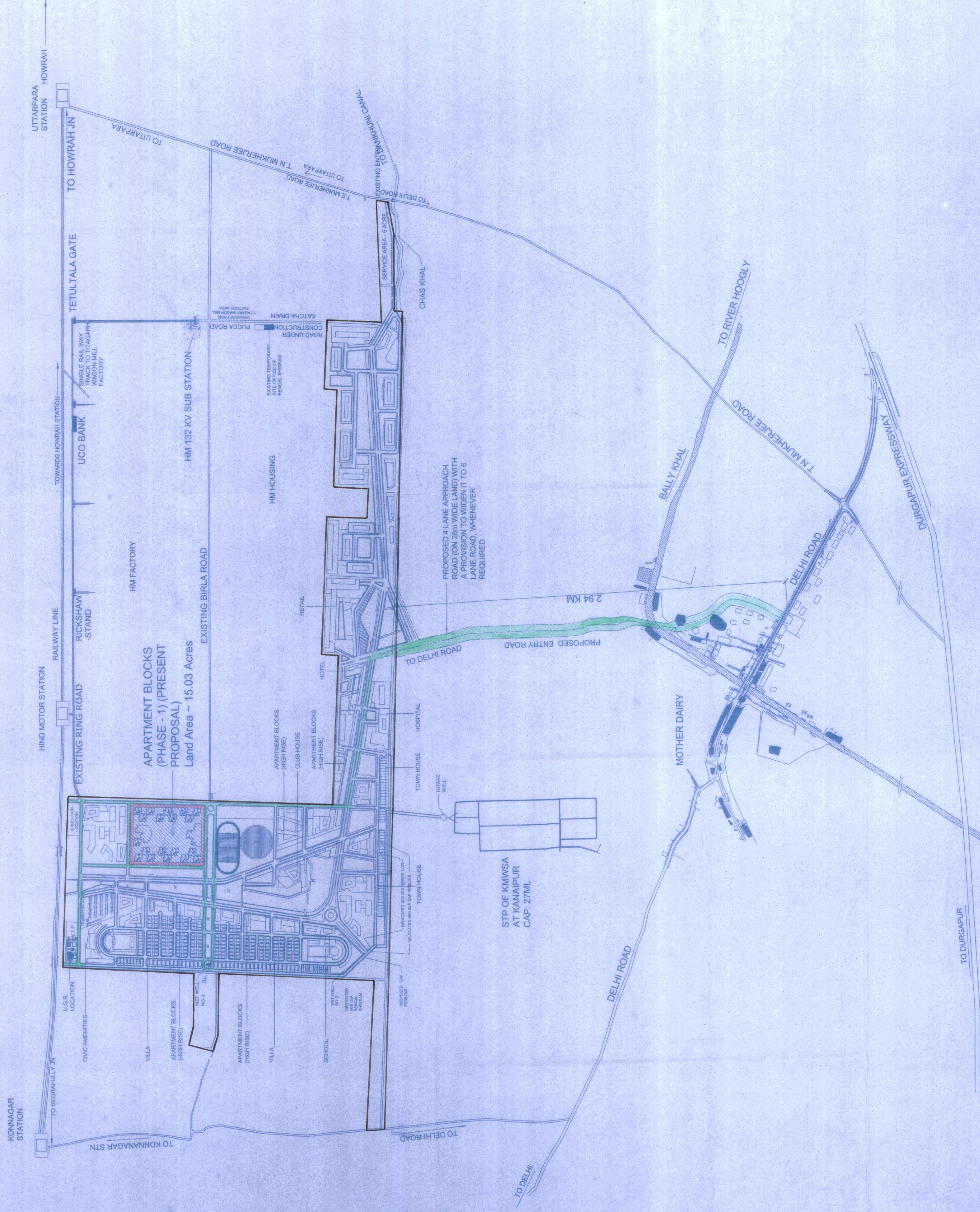
MASTER PLAN SHOWING LOCATION FOR PHASE 1