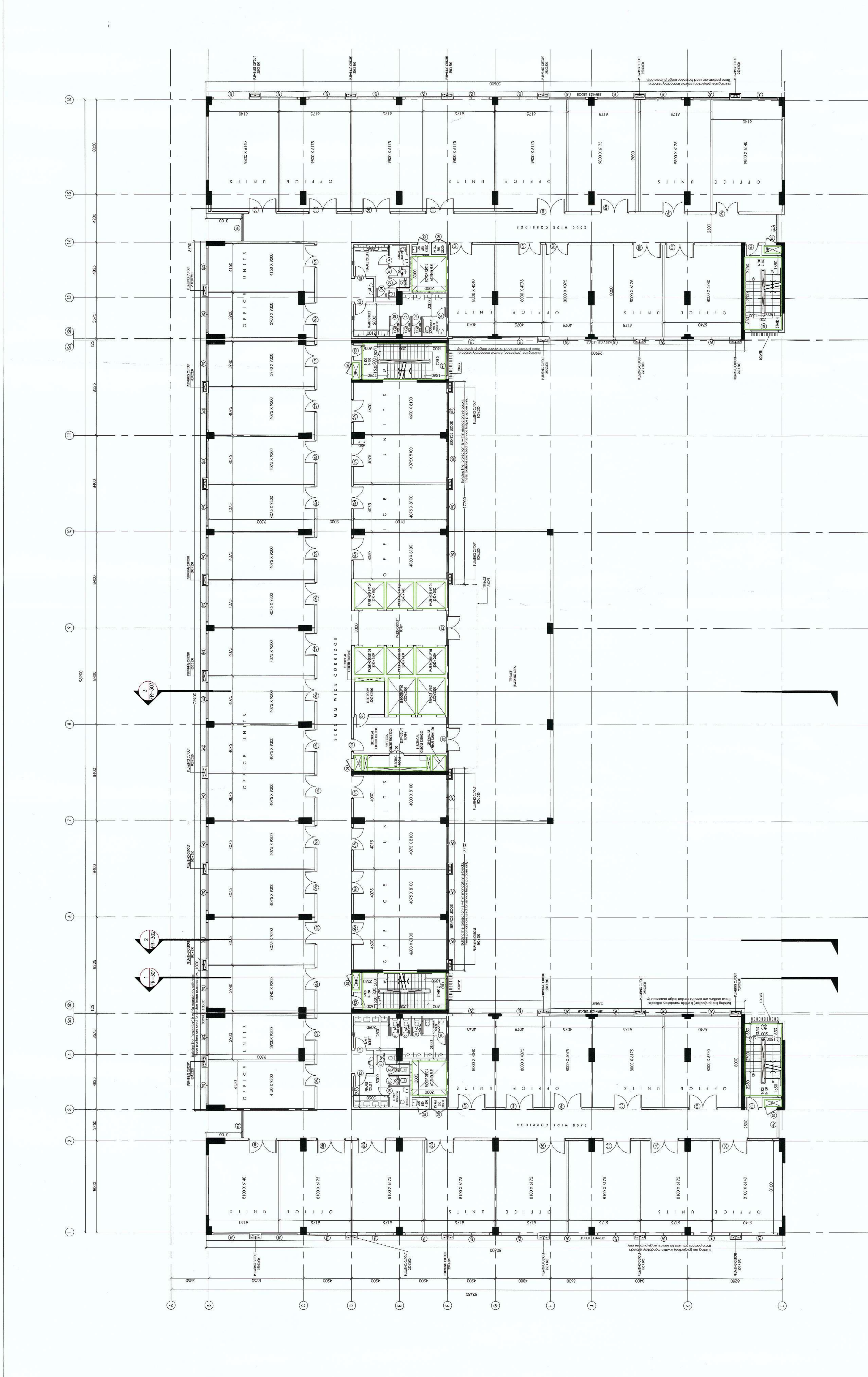
SECOND FLOOR PLAN SCALE 1:100