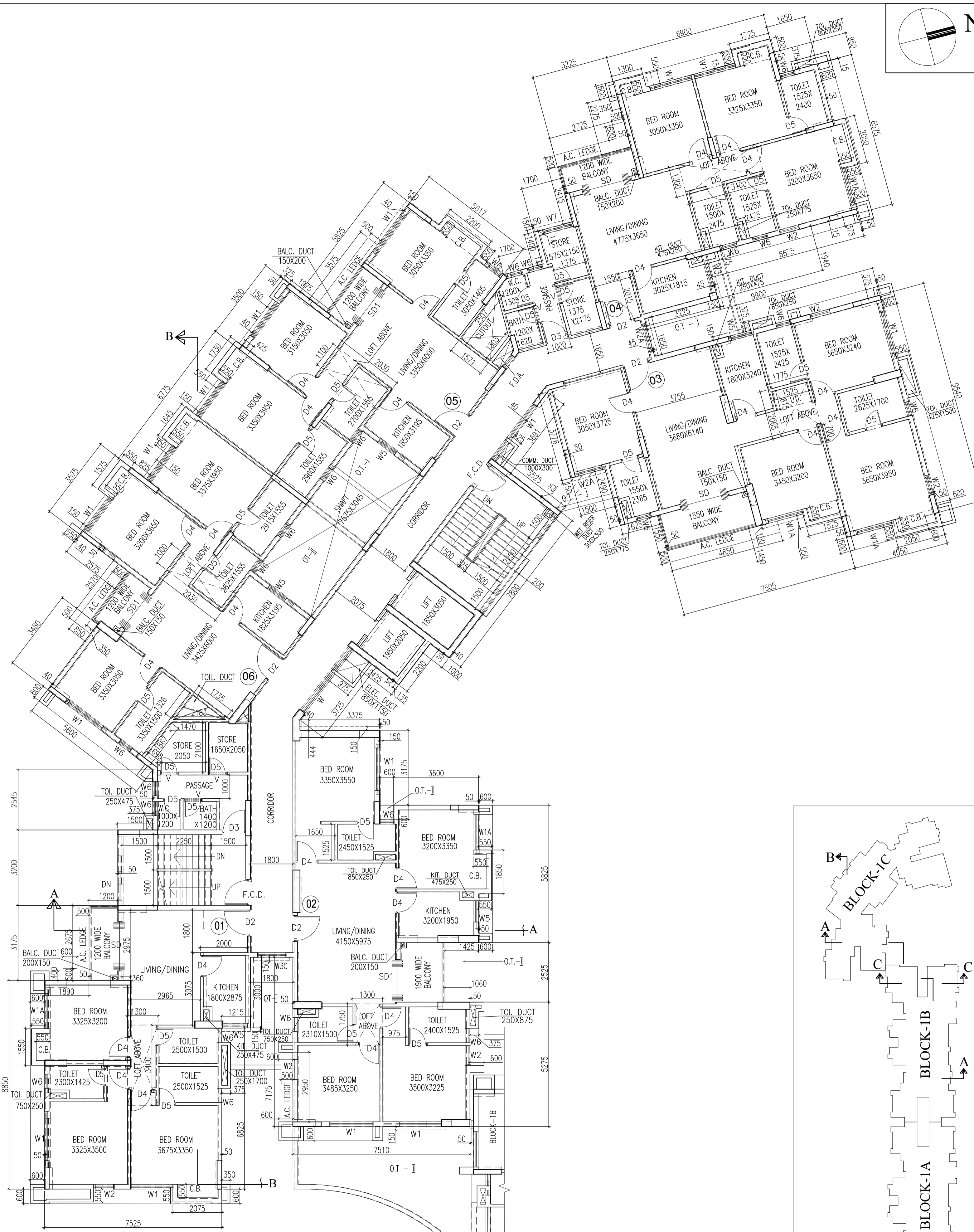
SECOND FLOOR PLAN BLOCK-1C