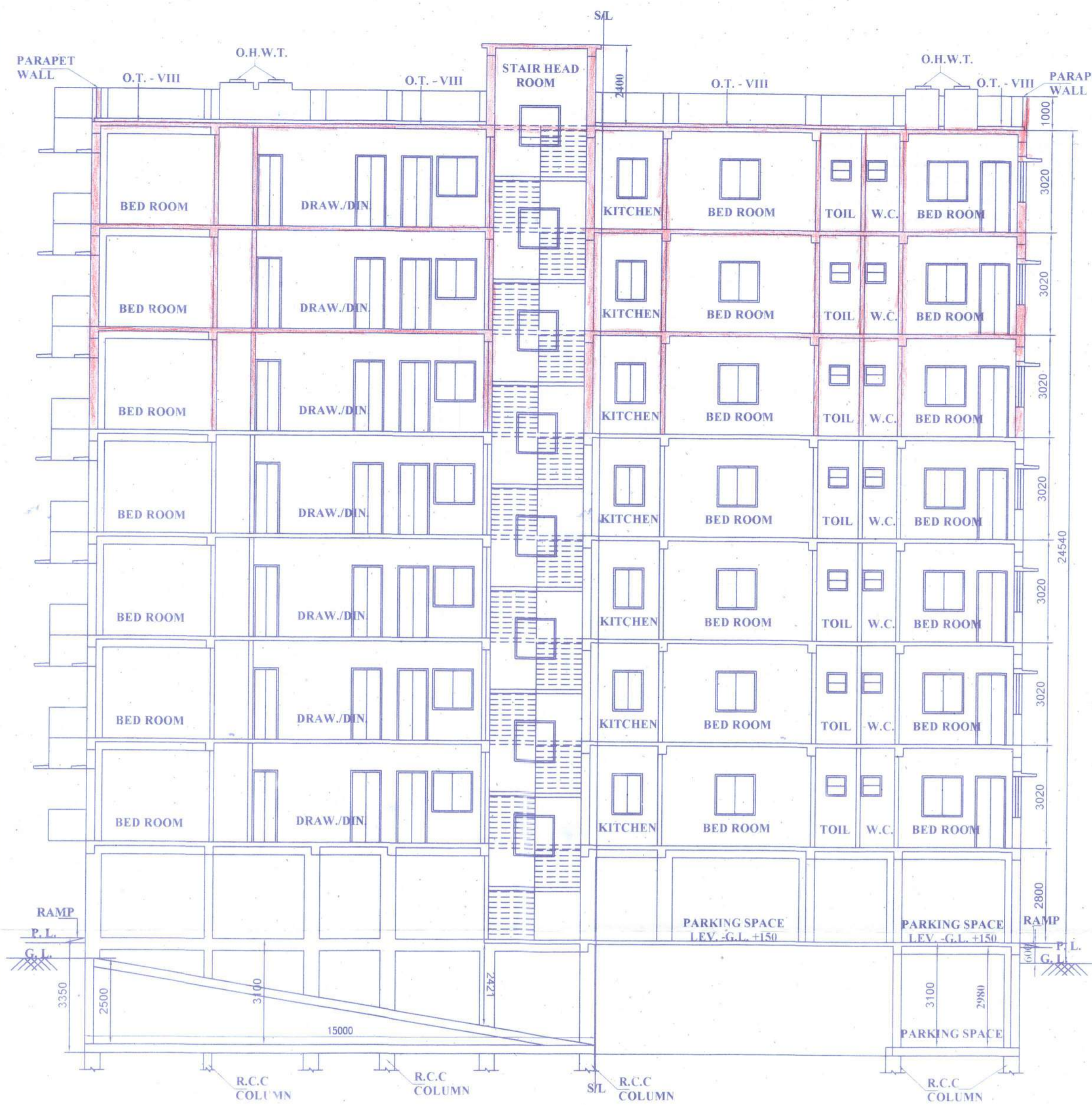
SECTION - BB SCALE : - 1:100