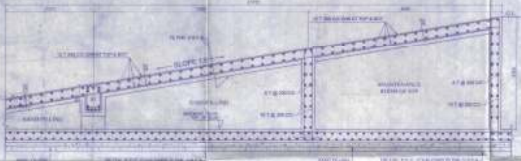
DETAILED LONGI SECTION OF RAMP