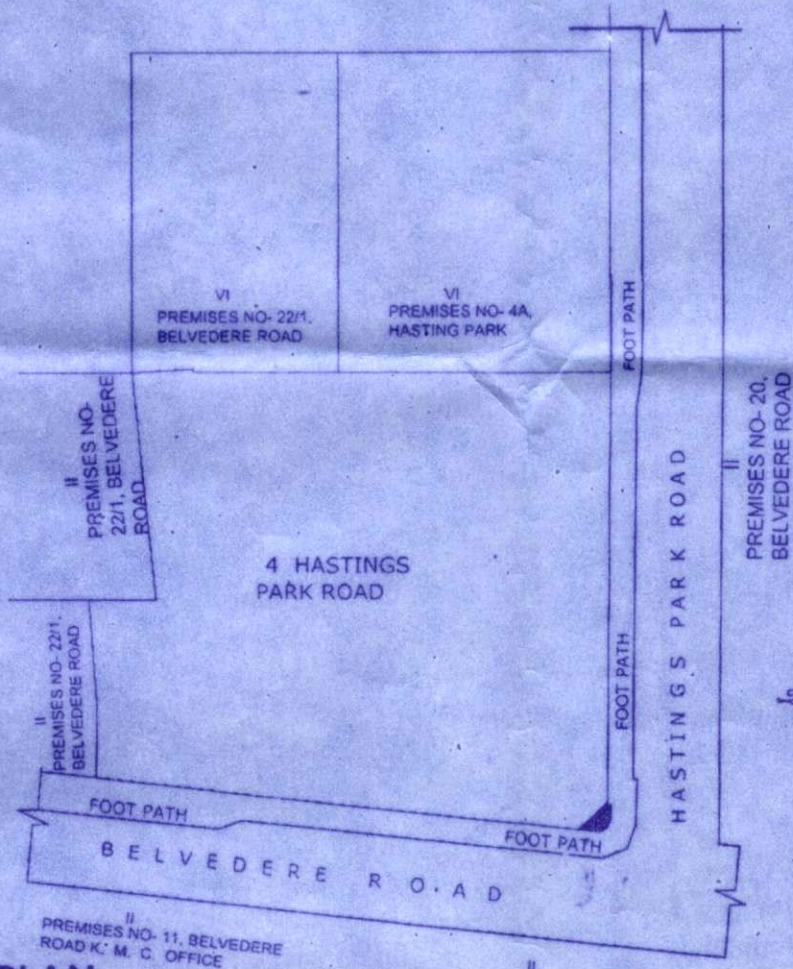
SITE PLAN SCALE- 1:600

SITE PLAN AT PREMISES NO: 4 HASTINGS PARK ROAD, BOROUGH-IX, WARD-74, KOLKATA-700027 UNDER KOLKATA MUNICIPAL CORPORATION NET LAND AREA = 1370.4997 SQM. = 20 K. 7 CH. 37 SQFT.