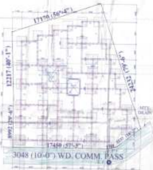
NINTH FLOOR PLAN