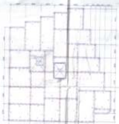
EIGHTH FLOOR PLAN