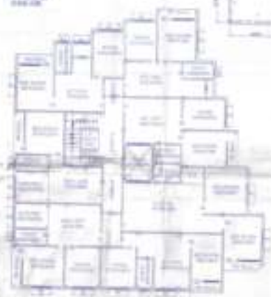
ELEVENTH FLOOR PLAN