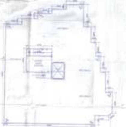
SEVENTH FLOOR PLAN