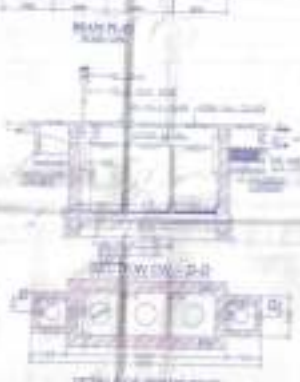
TWELFTH FLOOR PLAN

PROVIDED BY THE ARCHITECTURAL FIRM OF RECORD FOR THE PROJECT AND NOT FOR CONSTRUCTION. THE ARCHITECT ASSUMES NO LIABILITY FOR THE ACCURACY OF THE INFORMATION PROVIDED HEREIN. THE ARCHITECT ASSUMES NO LIABILITY FOR THE ACCURACY OF THE INFORMATION PROVIDED HEREIN.