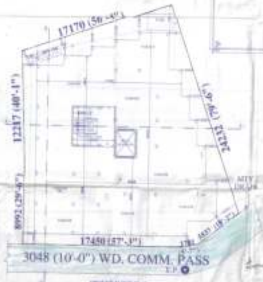
TENTH FLOOR PLAN