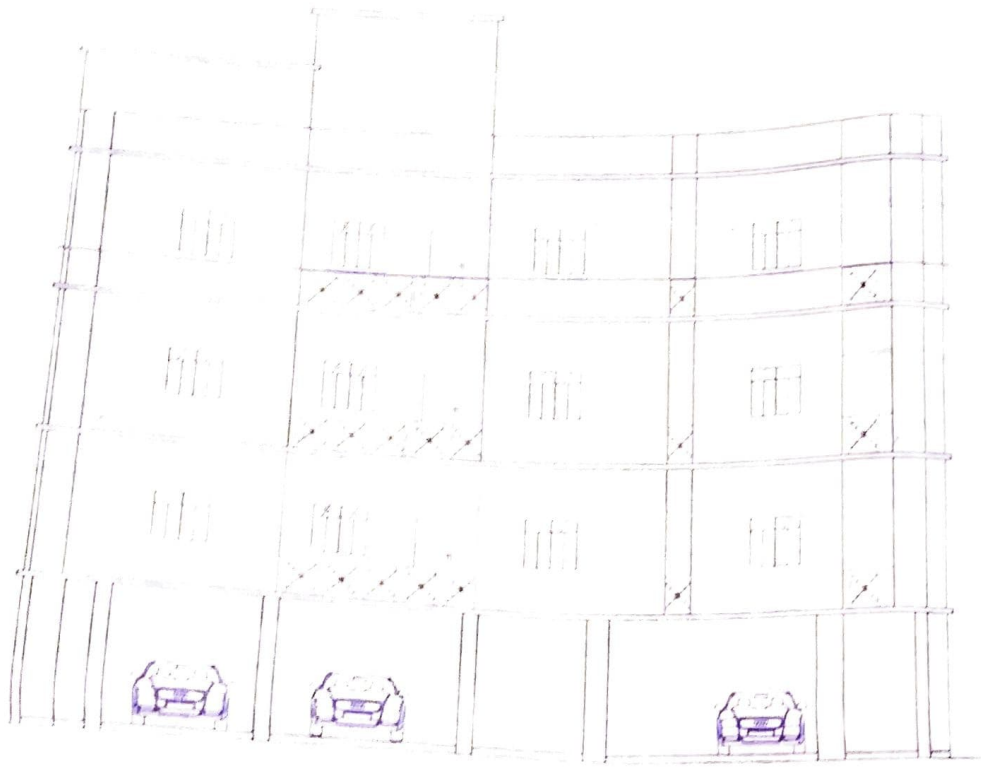
FRONT ELEVATION SCALE - ( 1 : 100 )