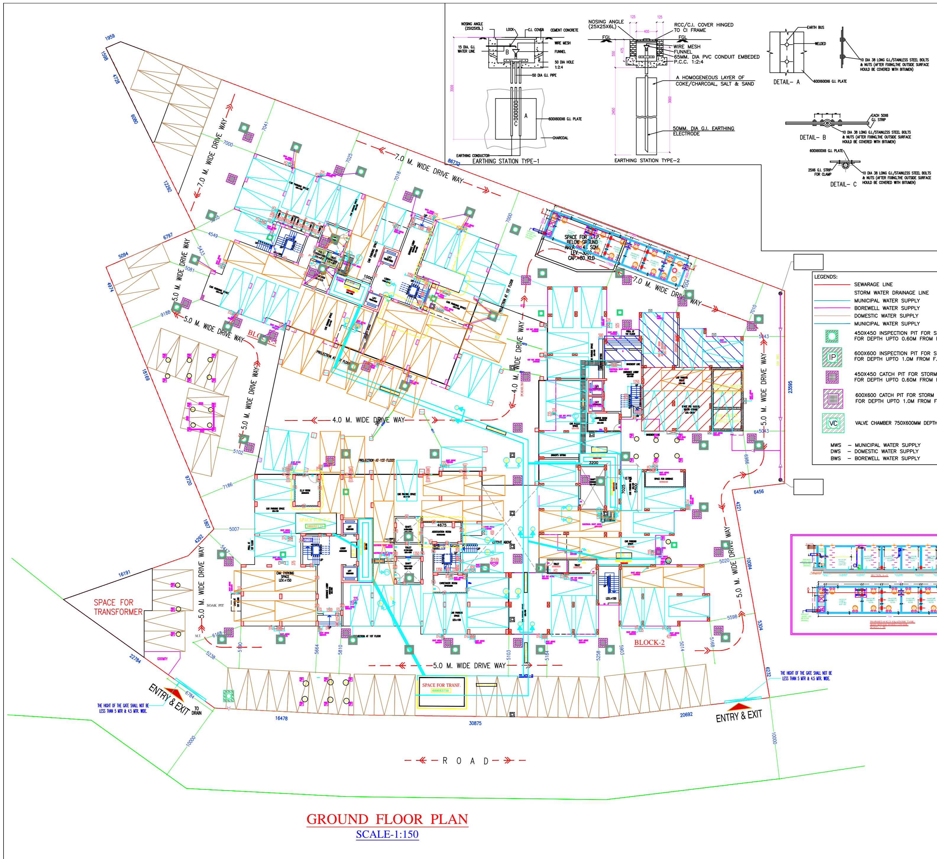
GROUND FLOOR PLAN SCALE:1:150