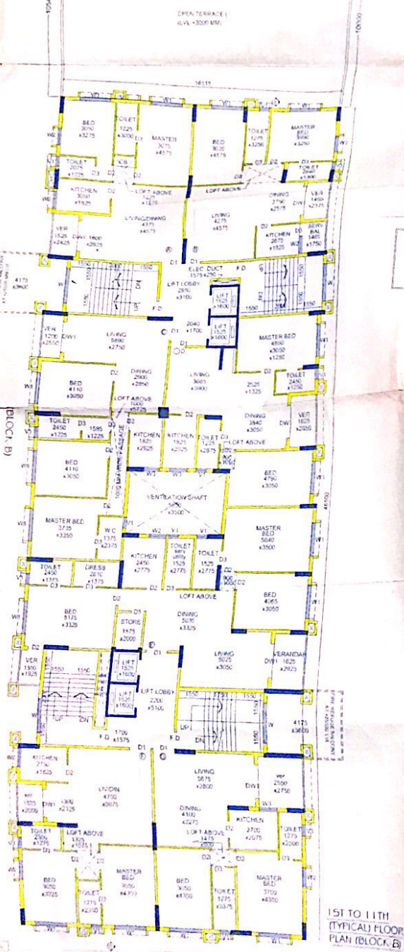
1ST TO 11TH (TYPICAL) FLOOR PLAN (BLOCK-B)