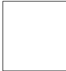
1 st Applicant