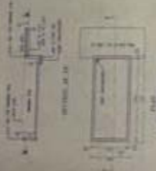
SECTION 2-2 FOUNDATION AND WALL