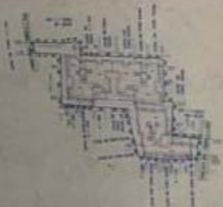
SECTION 2-3 TRUSS