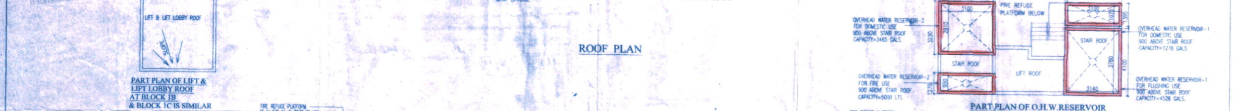
PART PLAN OF LIFT & LIFT LOBBY ROOF AT BLOCK IB & BLOCK IC IS SIMILAR