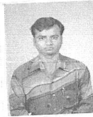
Photo of the presentant should be pasted in the front page of the document