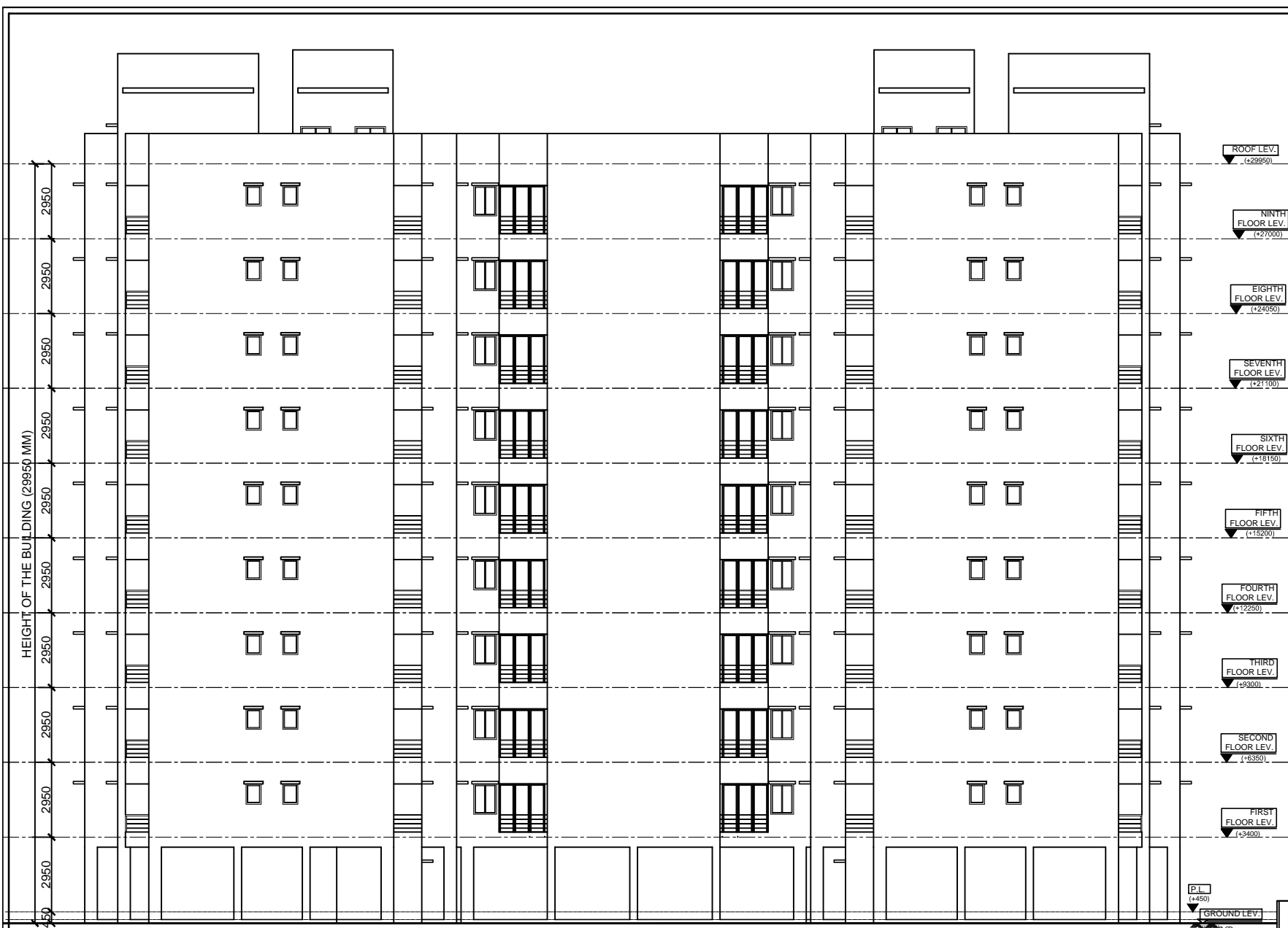
ELEVATION SIDE AT A BLOCK 1 & 2

PROPOSED G+X STORIED RESIDENTIAL COMPLEX AT R.S. DAG NO. -261,262 (P), 266 (P), 266/692(P), 267/705, 267(P) AND 268(P), MOUZA AMGACHIA, J.L. NO - 93, UNDER P.S. BISHNUPUR, DIST - SOUTH 24 PARGANAS, LOCAL LIMIT : AMGACHHIA GRAM PANCHAYET.