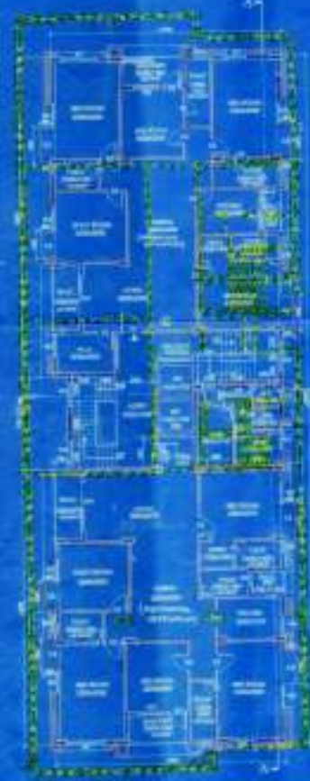
1TH FLOOR PLAN