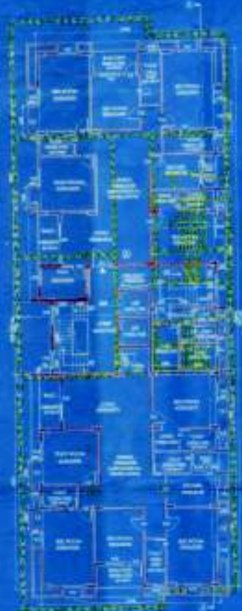
4TH FLOOR PLAN

ENGINEER: MICHAEL & SON 1010 W. 8th AVENUE, SUITE 1010, DENVER, CO 80231 303.733.1010 WWW.MICHAELANDSON.COM