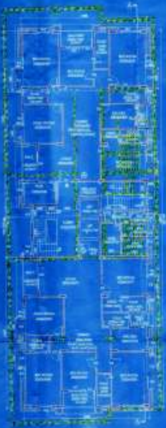
2TH FLOOR PLAN