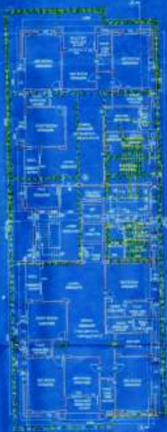
3TH FLOOR PLAN