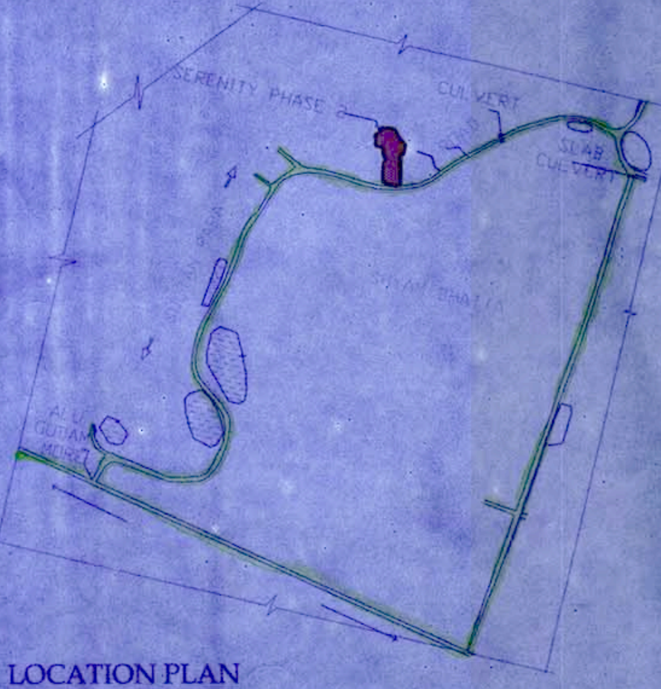
LOCATION PLAN (SCALE = 1: 12000)