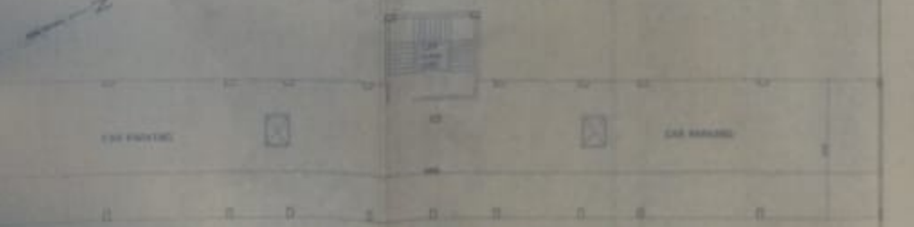
GROUND FLOOR PLAN OF BLOCK-A