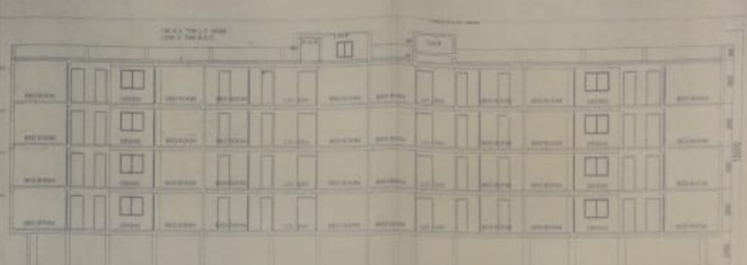
SECTION AT X-X' OF BLOCK-A