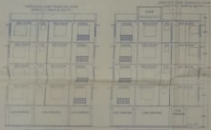
SECTION AT Y-Y' OF BLOCK-C

NOTES/SPECIFICATION 1. ALL DIMENSIONS ARE IN MM UNLESS OTHER WISE MENTIONED 2. DEPTH OF THE FOUNDATION OF KUD WATER RESERVOIR & SEPTIC TANK WILL NOT EXCEED THE DEPTH OF THE BUILDING FOUNDATION 3. 200 MM OUTSIDE BRICK WORK WITH CEMENT MORTAR (1:3) & 125 MM INSIDE BRICK WORK WITH CEMENT MORTAR (1:4) 4. BRICK WORK WITH EXTENSIVE CURPS SAND (RAJ) 1:1:4 (3:1:2:1) 5. GRADE OF CONCRETE M20 GRADE OF STEEL 141 6. PLASTERING WITH CEMENT SAND MORTAR (1:4) FOR RCC WORK & (1:1) FOR BRICK WORK 7. PLAN CEMENT CONCRETE WITH BRICK, KHDA, SAND & CEMENT (1:1:1) 8. LIME TERRACING WITH BRICK KHDA, SURKIA (1:1:1:2:1)