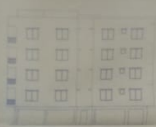
FRONT ELEVATION OF BLOCK-C

PROPOSED G + IV STORIED RESIDENTIAL BUILDING PLAN AT L.R.DAG NO:-1247,1248,1249,1250,1252 & 1268L.R.KHATI ANNO:-4579,4580, 4581,5527,5533,5534,5535,5536,5537,5636,5637,5638,5639, 5640, 5641,5642; J.L.NO.-13, MOUZA-RECKJUANI, DIST.-24 PGS(N),P.S. RAJARHAT WITHIN THE JURISDICTION OF RAJARHAT-BISHNUPUR 1 NO.GRAM PANCHAYET.