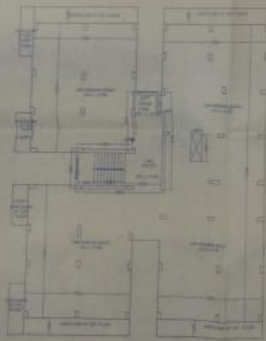
GROUND FLOOR PLAN OF BLOCK-C