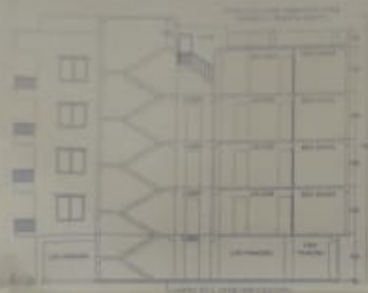
SECTION AT X-X' OF BLOCK-C