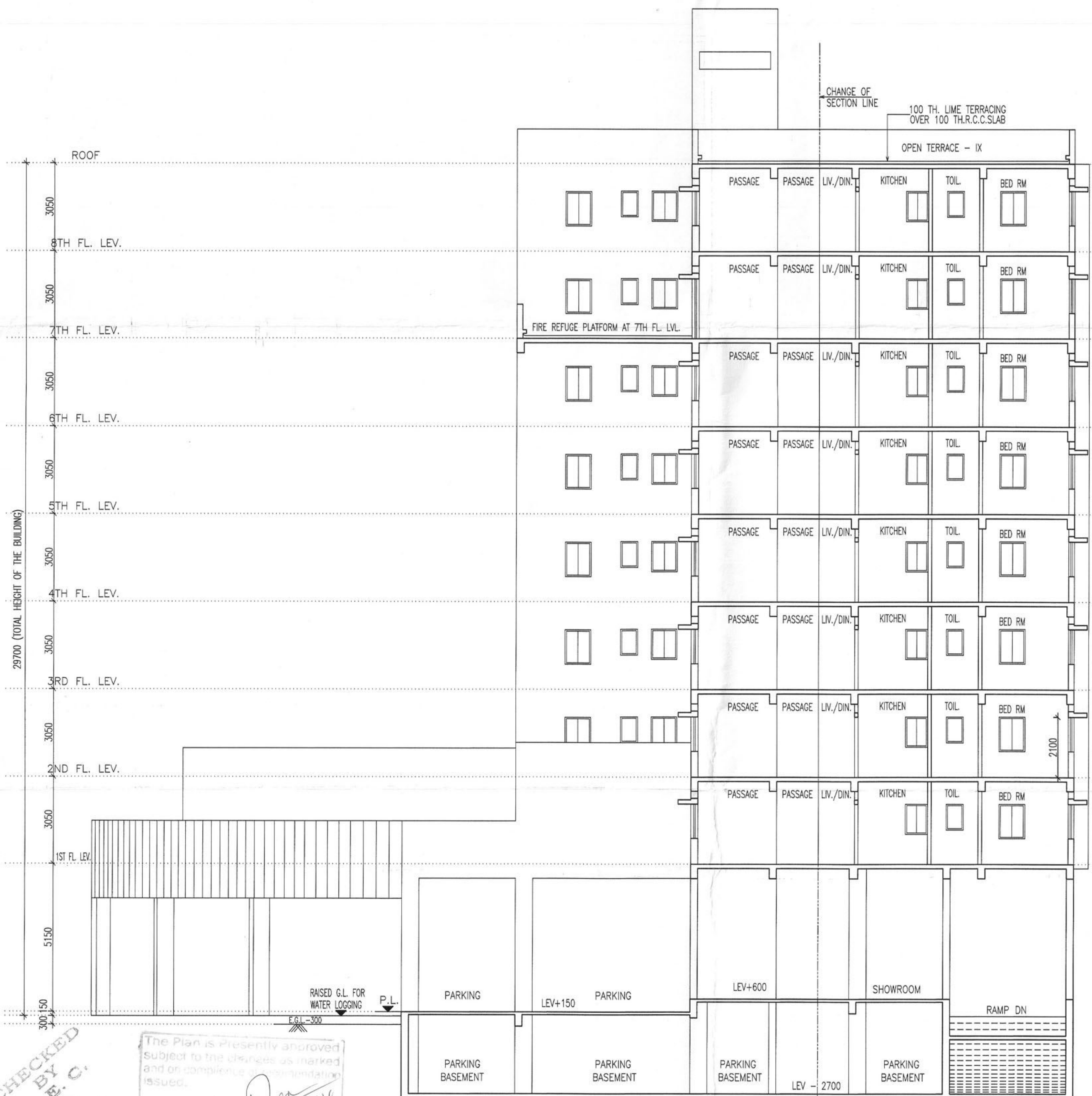
SECTION : B-B BLOCK-1 SCALE * 1:100