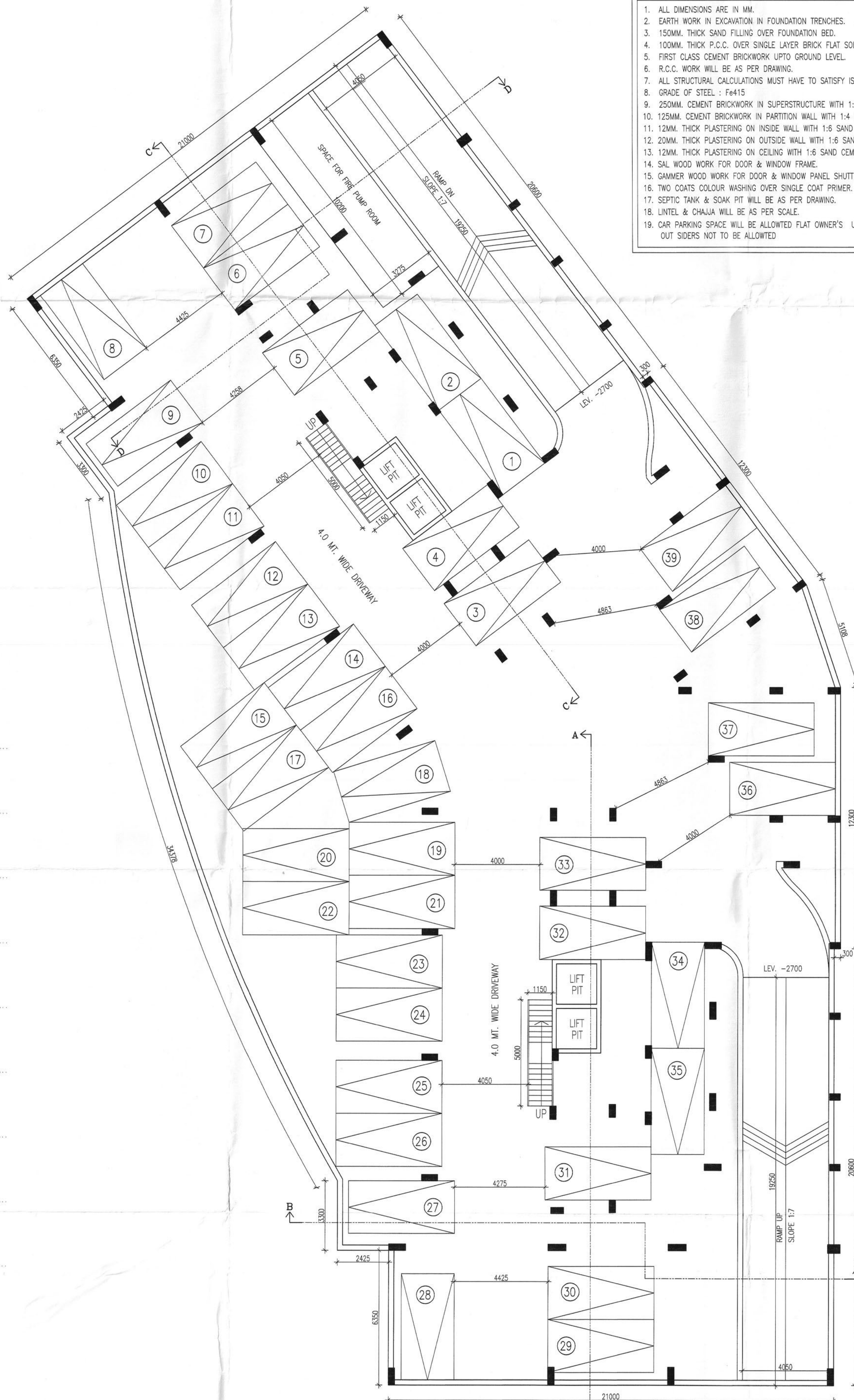
BASEMENT FLOOR PLAN BLOCK-1 & 2 SCALE * 1:100

EXT. CONST. SHOWN IN COL --- PROP. CONST. SHOWN IN COL --- PROPERTY LINE SHOWN IN COL --- ROAD SHOWN IN COL --- DRAIN SHOWN IN COL ---