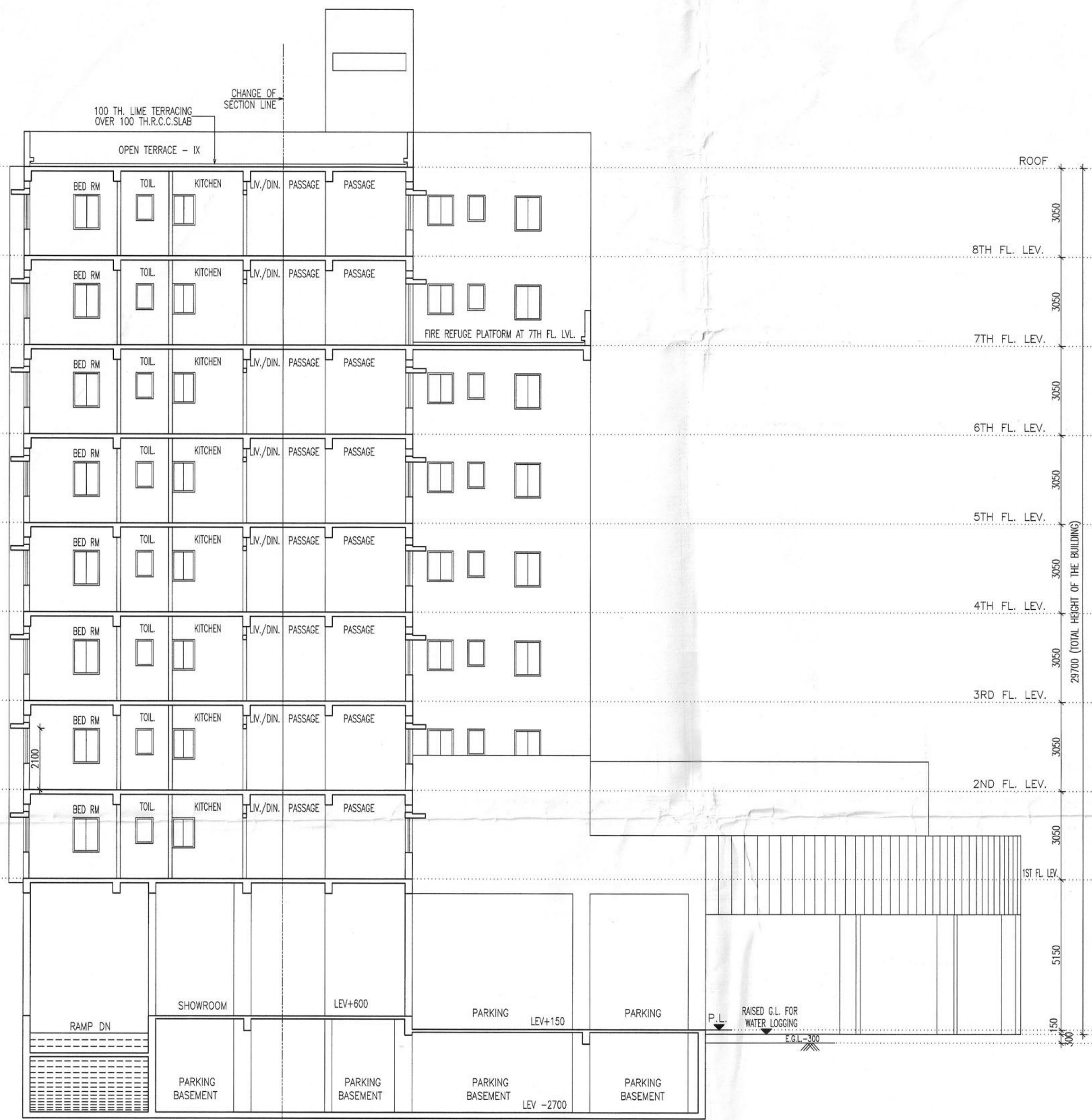
SECTION : D-D BLOCK-2 SCALE * 1:100