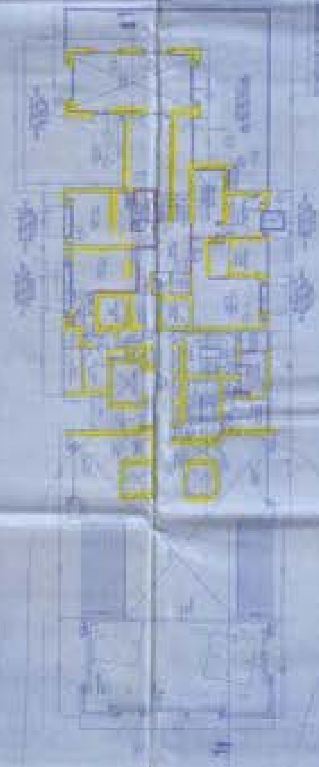
WING A - FLOOR AT LEVEL - 29TH scale 1:200

PROJECT: [illegible] CLIENT: [illegible] ARCHITECT: [illegible] DATE: [illegible] SHEET: 18 of 26 | R8 PROJECT LOCATION: [illegible] PROJECT NO.: [illegible] DRAWING NO.: [illegible] SCALE: 1:200 DATE: [illegible]