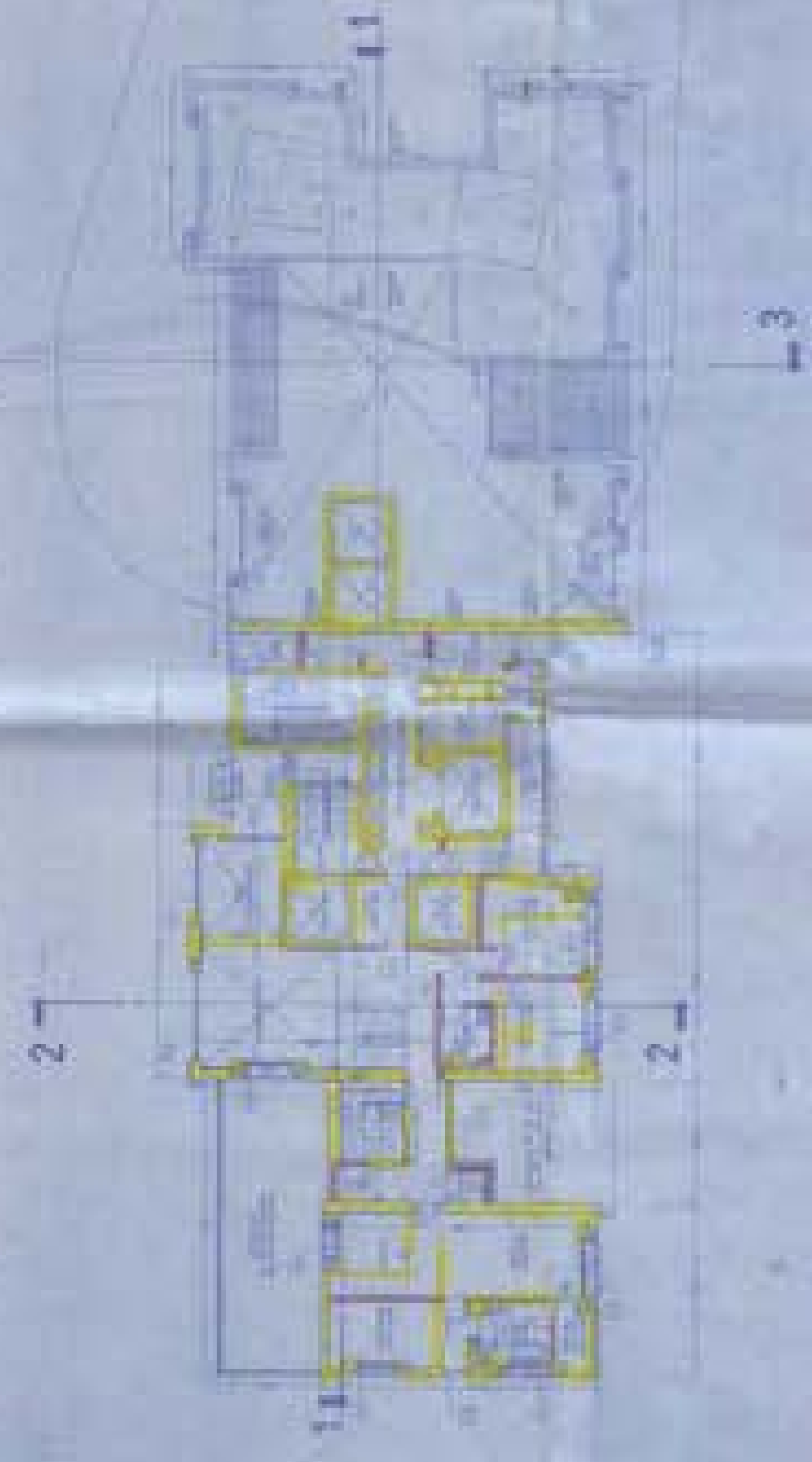
WING B - FLOOR AT LEVEL - 1M - LVL (+) 100.16 M scale 1:200