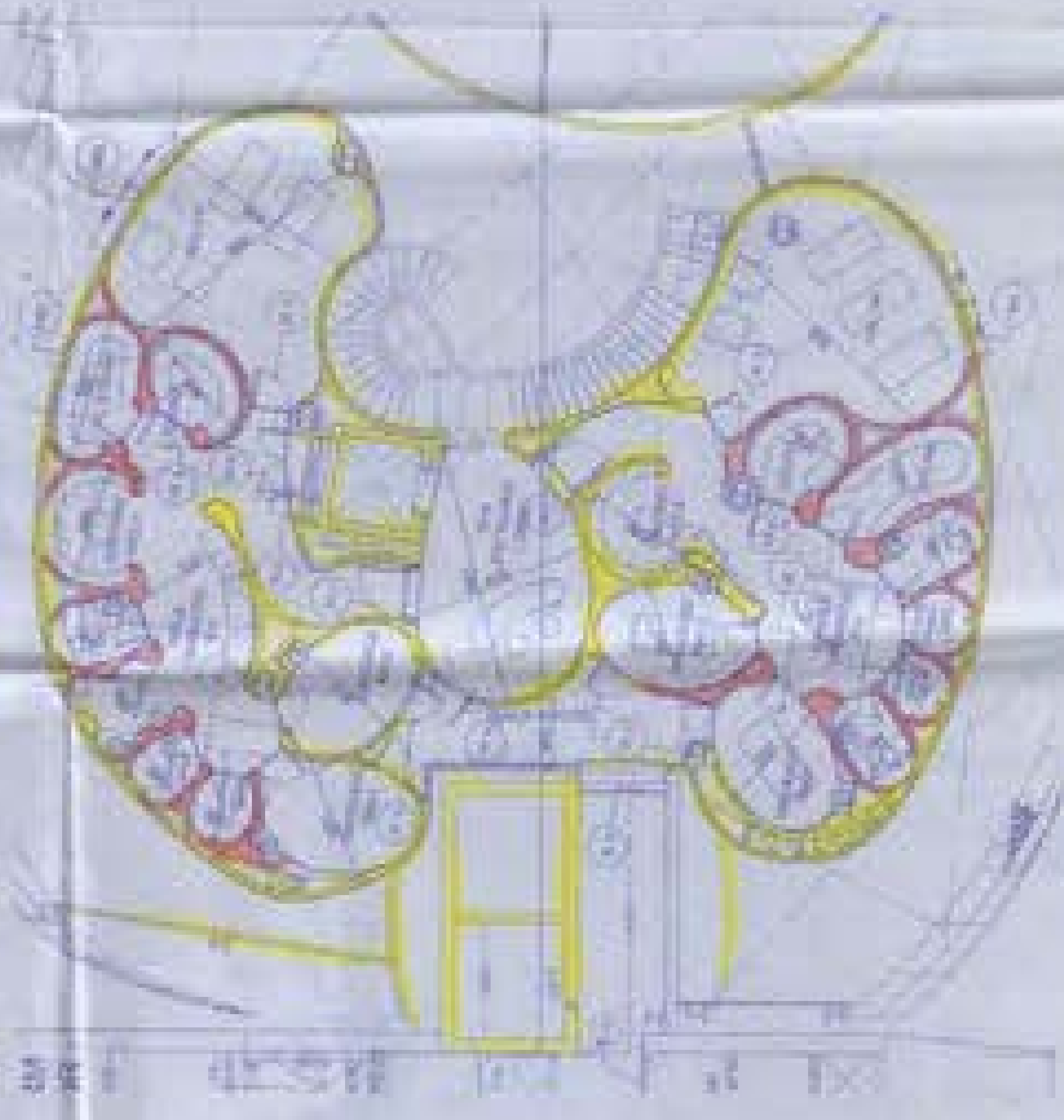
WING B - SPA LAYOUT - FLOOR AT LEVEL - 32ND scale 1:100