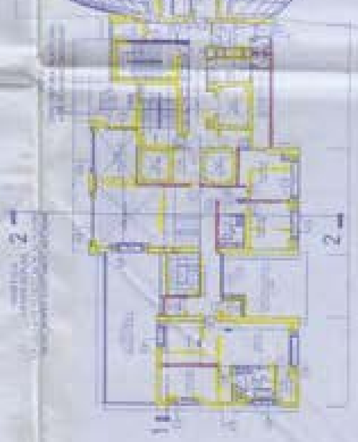
WING B - 33RD FLOOR PLAN LVL (+) 113.76 M scale 1:200