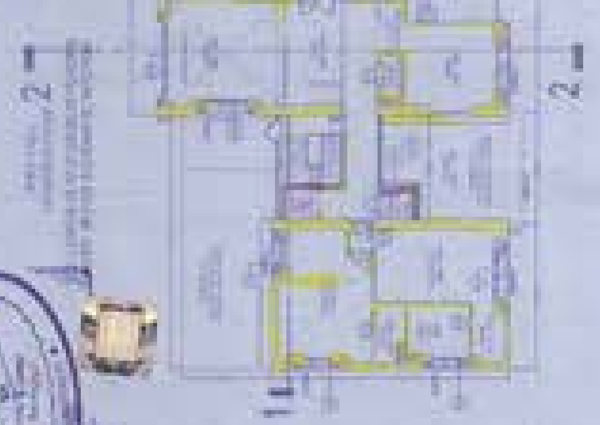
WING B - 32ND FLOOR PLAN LVL (+) 110.36 M scale 1:200