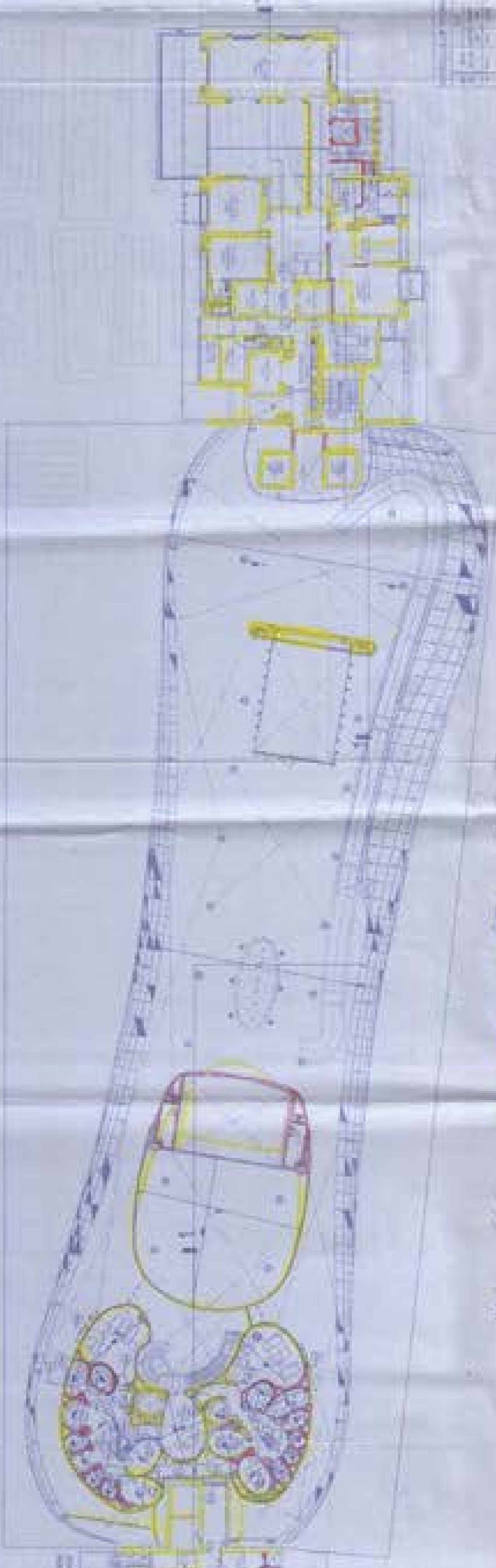
WING A - 32ND FLOOR PLAN scale 1:200