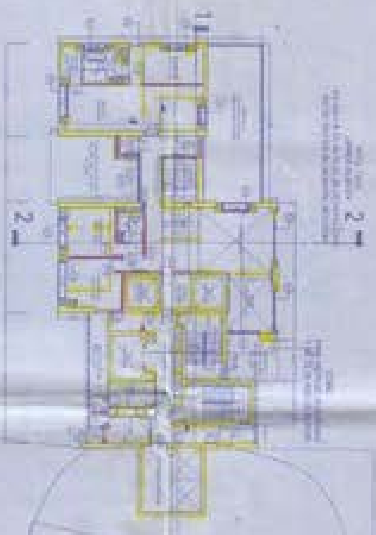
WING B - 35TH FLOOR PLAN LEVEL (+) 120.56 M SCALE 1:200