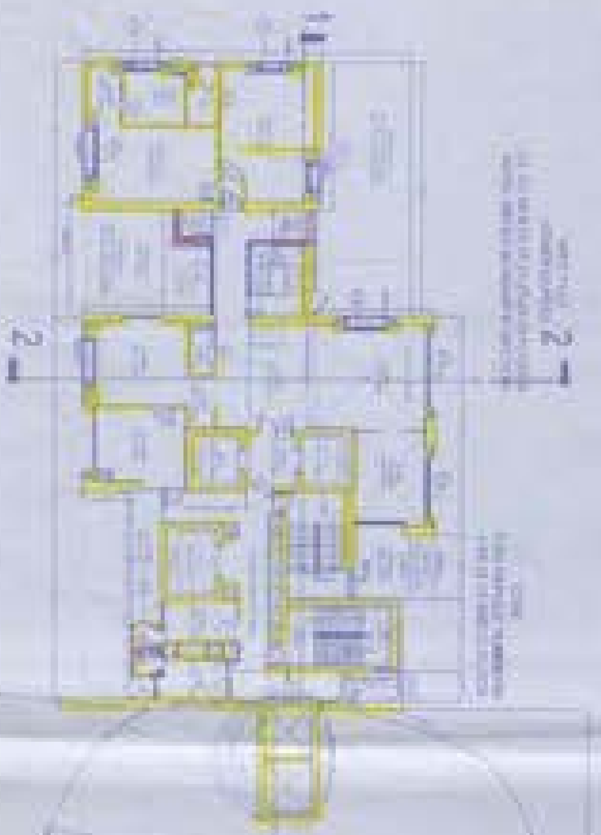
WING B - 34TH FLOOR PLAN LEVEL (+) 117.16 M SCALE 1:200